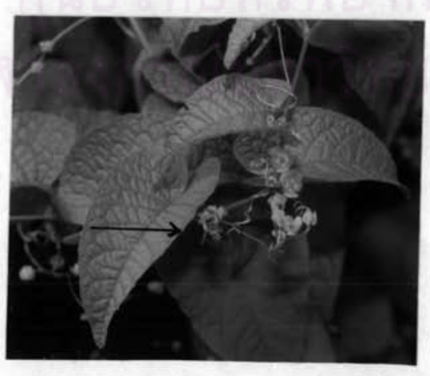
Figure 3.8 : A. cerana on Antigonom leptopus flower.