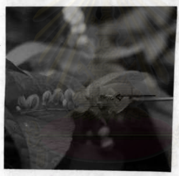
Figure 3.7 : A. florea on Antigonom leptopus flower.