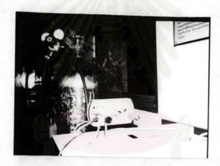
Figure 3.4 : Electric microapplicator.