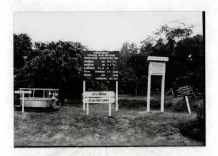
Figure 3.10 : A meteological station in Chitralada Royal Palace.

8. Methodology in the study of the effect of neem extract on the larvae of A. cerana.