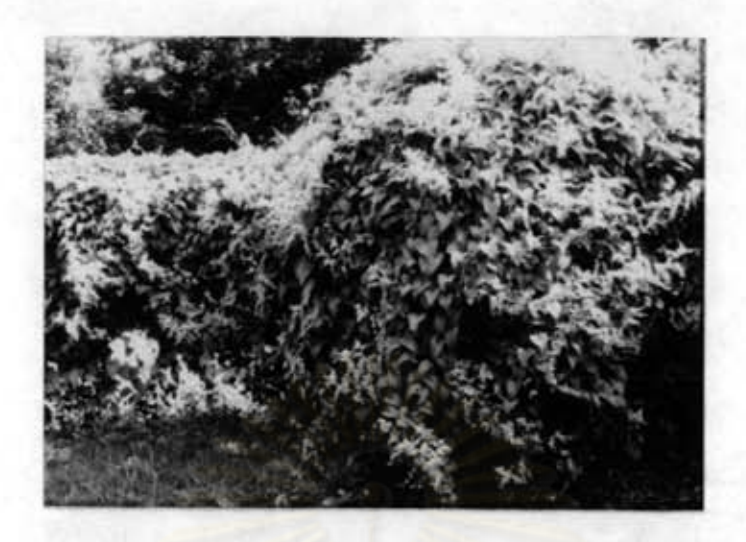
Figure 3.6 : A fence of Antigonon leptopus at Chitralada Royal Palace.