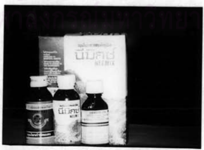
Figure 3.2 : Commercial neem extract.