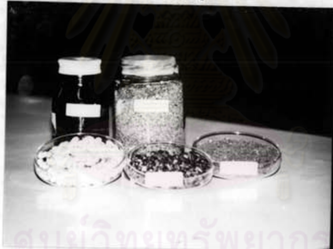
Figure 3.1 : Neem extract.

If % mortality in control group was more than 20%, the experiment had to repeated. A graph showing the relationship between the concentration of the tested pesticide/extract and the % corrected mortality was constructed for each pesticide solution/extract using Probit analysis (Finney, 1971). The LD<sub>50</sub> for each pesticide solution/extract was determined from the graph.