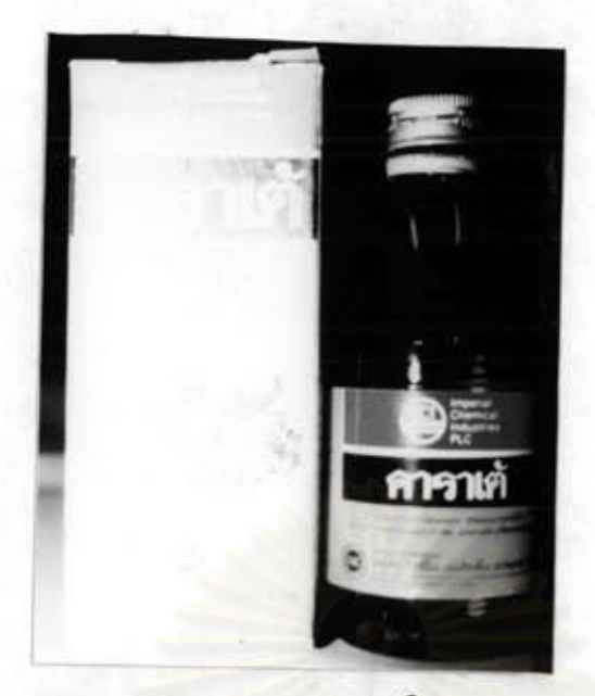
Figure 3.3 : Cyhalothrin (Karate ®)