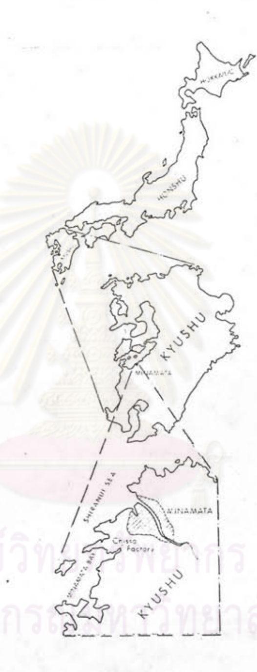
Fig. 2-2 Location of island of Kyushu, Minamata, the Chisso factory and Minamata Bay.