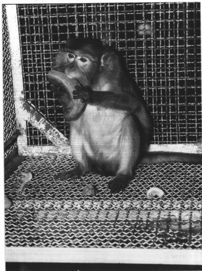
รูปที่ 9 แสดงลิงหางยาวเพศเมีย ( Macaca fascicularis ) อายุ 9 ปี