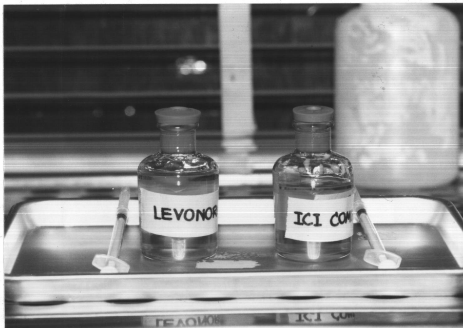
รูปที่ 10 แสดงเลวโนอร์เจสเตรลและสารไอซีไอ ซึ่งละลายในน้ำมันงา