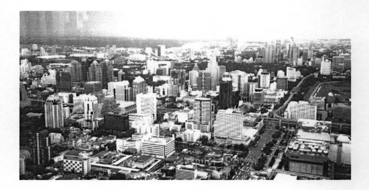
Figure 1.1 Oblique view of Bangkok, Thailand

Bangkok is the capital city of the Kingdom of Thailand. Thailand is situated in the East of Andaman-Sumatran earthquake belt as part of Trans-Asiatic belt. Each time that major quakes transpired in such belts, it was always felt in Bangkok (Hwan, 1985).