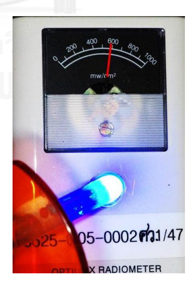
Figure 11 Light intensity checked with radiometer