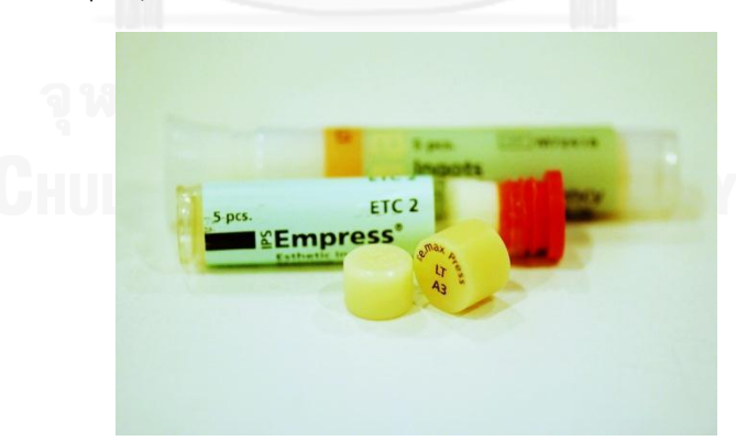
Figure 1 IPS Empress Esthetic and IPS e.max ingots