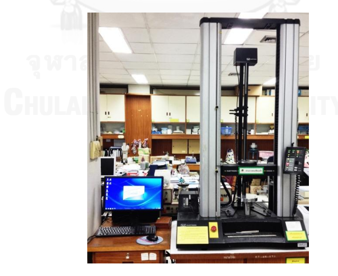
Figure 3 Universal Testing Machine, Instron model 5566, Canton, MA, USA