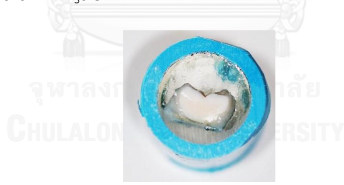
Figure 4 Tooth specimen embedded in resin

Next, each tooth was sectioned with an IsoMet low-speed saw (Buehler, Lake Bluff, IL, USA) in order to obtain specimens with dimensions of 3 \times 6 \times 4 \text{ mm}^3 . Surface grinding was employed to achieve a uniform thickness of 4 mm. The specimens were embedded in unfilled resin, with the flat, polished enamel surface exposed, as shown in figure 4.