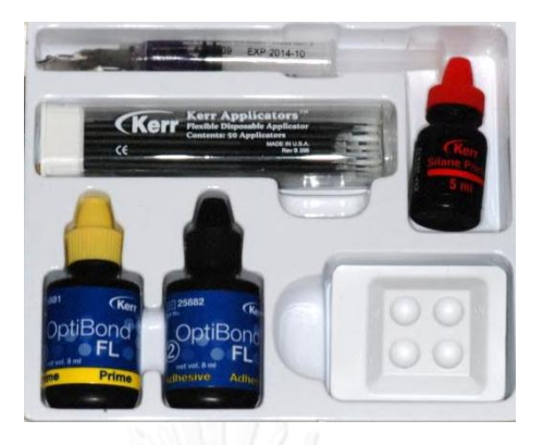
Figure 2 Optibond FL set and Silane Primer