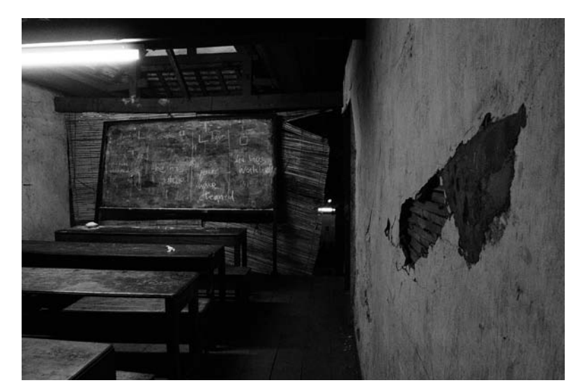
Figure 1. Temple Class

and novices, all of whom lack the funds and resources for quality education and nourishment, and are desperate to learn English language and computer skills in an effort to break their cycle of poverty and create economic mobility for themselves, their families and indeed whole communities." (S.M.I.L.E Project, 2013)