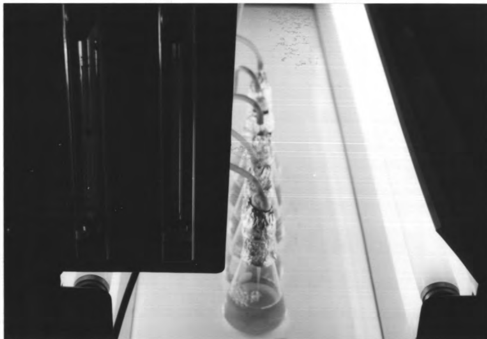
Figure 2.1 Set up of an apparatus for Chlamydomonas reinhardtii Cultivation.

Illuminations are from both sides of the culture vessels. Two sets of Rotar meter can be seen on the left-handed side, one controls the flow rate of air generating from an air pump and the other controls the flow rate of carbon dioxide from the reservoir providing air with 4-5% carbon dioxide.