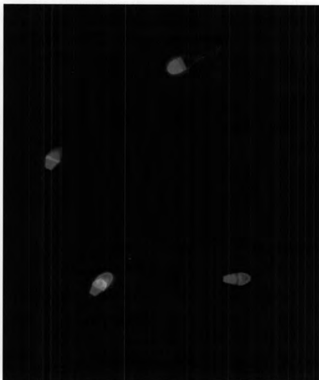
Figure 7 A photomicrograph of stallion spermatozoa stained with FITC-PNA/Ethidium homodimer-1. The spermatozoa with intact acrosome were stained green with FITC-PNA, while the spermatozoa with damaged or loss acrosome were stained red with EthD-1 (1000x magnification).