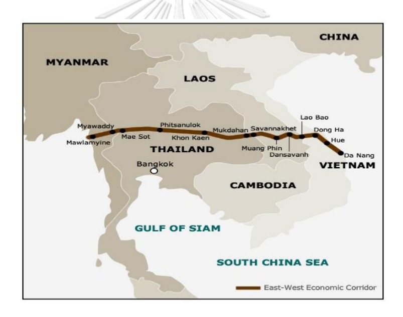
Figure 2: Mapping of East-West Economic Corridor for Thailand, Myanmar, Laos and Vietnam

increase border trade as the area is a part of the Asian's East-West Corridor that connects Myanmar with Laos and Vietnam (Burmese Migrant Workers' Education Committee, 2013; Hong Kong Trade Development Council, 2015; National News Bureau of Thailand, 2013). Such prospect glory of the rapid economic booming and extensive development plan in Mae Sot district, Tak province have been attracting a rising number of Myanmar women who want to earn significant amount of incomes by joining sex industry as MFSW in Thailand and even in the other countries.