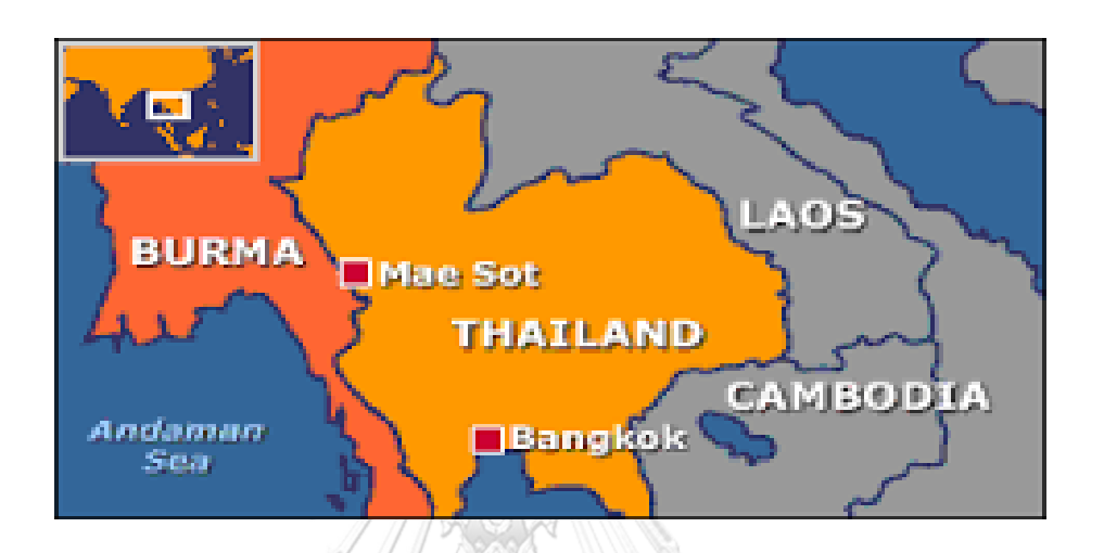
Figure 3: Map of Mae Sot district, Tak Province

populations such as TB, malaria and particularly the HIV/AIDS. Besides, Mae Sot district was a strategic area for sex industry with large demand and supply of prostitution business, especially MFSW.