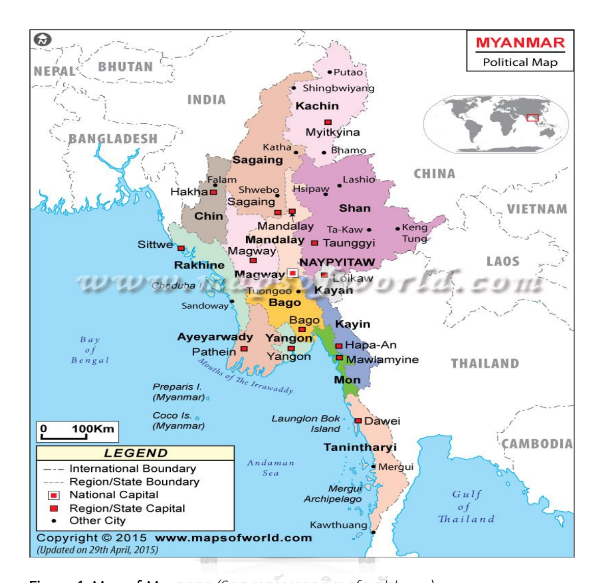
Figure 4: Map of Myanmar