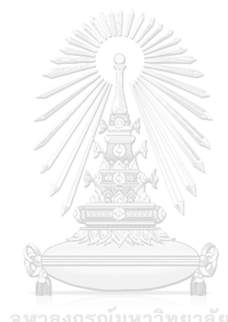
จุฬาลงกรณ์มหาวิทยาลัย Chill Al ANGKARN UNIVERSITY