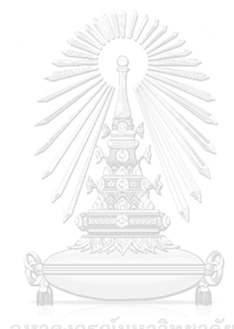
จุฬาลงกรณ์มหาวิทยาลัย Chill Al ANGKARN UNIVERSITY