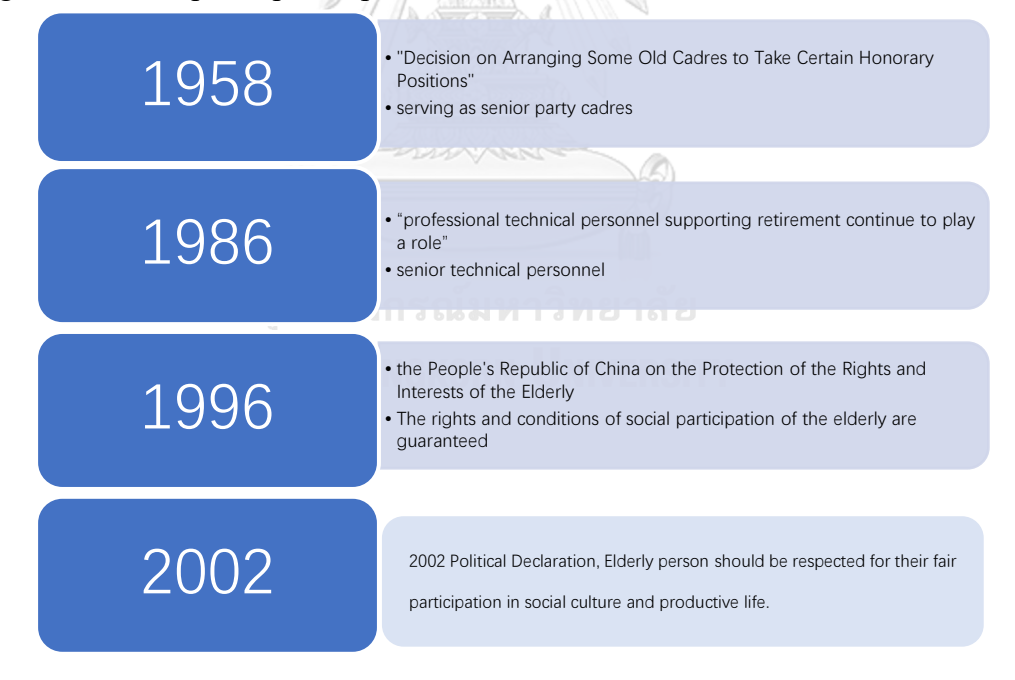
Figure 1Social participation policies

In the 2002 Political Declaration, meeting the expectations of the elderly and the economic needs of the society, the elderly should be allowed to fully participate in the economic, political, social and cultural life of the society. As long as the elderly can participate in social life, they should be respected for their fair participation in social culture and productive life.