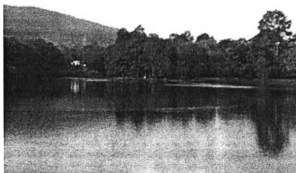
Figure 3.1: The pictorial view of Aung-Keaw Reservoir

Aung-Keaw Reservoir is located in Chiang Mai University, Tumbol Suthep, Amphur Muang, Chiang Mai province, Thailand. The pictorial view of Aung-Keaw Reservoir is depicted in Figure 3.1. Water from Aung-Keaw Reservoir is utilized as the raw water for the Aung-Keaw water supply plant. The Aung-Keaw water supply plant has the capacity to produce the water supply of approximately 500-800 m 3 /day. The produced water from Aung-Keaw water supply plant was distributed for drinking, bathing, and household used for all the communities, facilities, offices and dormitories in Chiang Mai University, Chiang Mai province, Thailand.