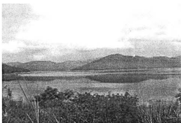
Figure 3.2: The pictorial view of Mae-Kuang Reservoir

Mae-Kuang Reservoir is located near Wangtarn village, Tumbol Loungnueng, Amphur Doisaket, Chiang Mai province, Thailand. The pictorial view of Mae-Kuang Reservoir is illustrated in Figure 3.2. . Water from Mae-Kuang Reservoir was used as the raw water for producing a potable water supply. A capacity of approximately 52,800 m 3 /day can be produced from the Mae-Kuang water supply plant. Water from the supply plant was distributed to consumers in Amphur Muang, Chiang Mai province, for drinking, bathing and household activities.