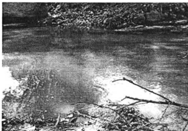
Figure 3.3: The pictorial view of Mae-Sa River