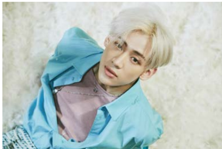
Figure 8: A Thai member in Korean Boy Band “GOT 7 BAMBAM”

For instance, many big entertainment companies have created Boy and Girl groups including Thai people such as Nickhun of 2PM, Bambam of GOT7, TEN of NCT and so on. This relation will build up the intimacy and lessen the barrier of the race between Korea and Thailand as well. The last element is foreign policy, the Korean government played a significant role in terms of Korean Wave intensive promotion. They will bring the K-POP boys or Girls bands to roadshow and support the K-POP free concert in foreign countries. Using this cultural export to go around and be more internationalization, Korean has earned a lot of benefits from this policy.