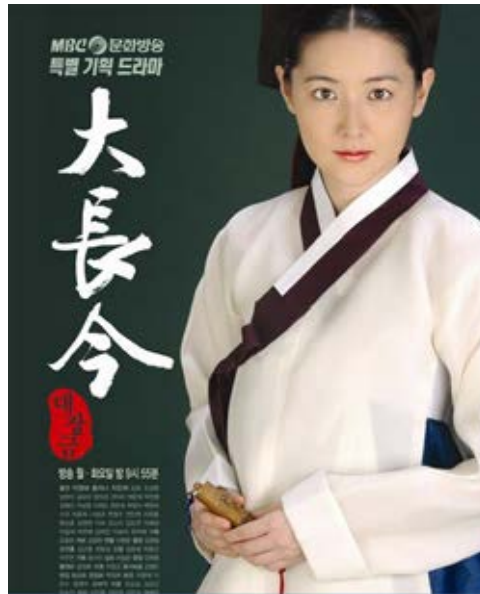
Figure 6: Korean Popular Drama series “Dae Jang Geum (2003)”