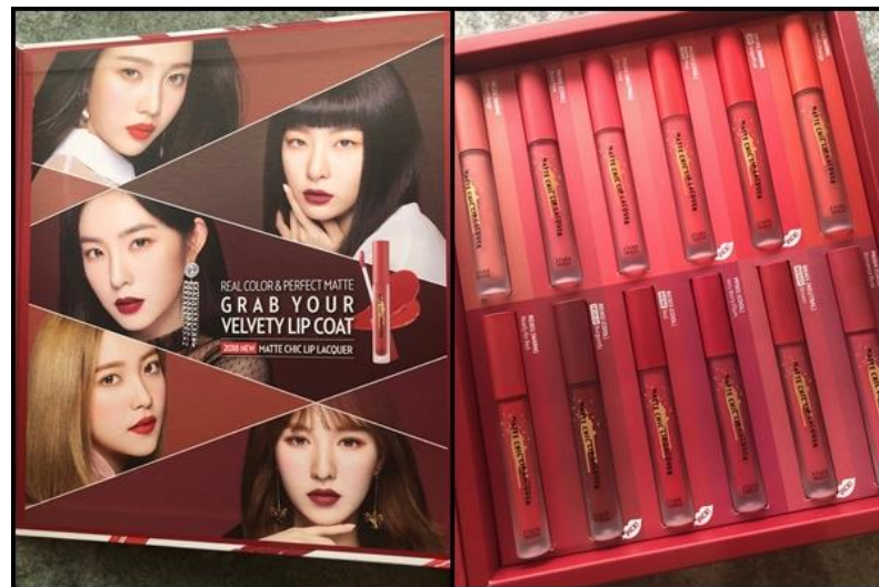
Figure 9: Etude House with Korean Popular Girl Band “Red Velvet”

the Korean food, they willing to taste those food too, hence this demand led to importing many Korean restaurants in Thailand. And the same with boy bands or girl bands experiences, now there are many Korean bands' concert in Thailand such as EXO, Super Junior, TVXQ, Twice, 2PM, GOT7 and so on. These artists who are endorsed by Korean cosmetics also help the cosmetic industry in order to invest and distribute in Thailand such as Etude House: Red Velvet, Nature Republic: EXO, It's skin: GOT7, Innisfree: Lee Minho and so on. The drama, Coffee Prince also supported the coffee shop investment such as TOM n' TOM and Holly's Coffee as well.