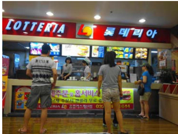
Figure 3: Korean Fast Food brand “Lotteria”