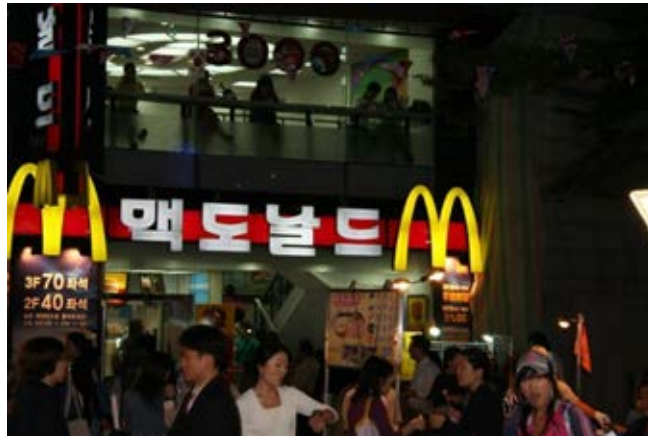
Figure 2: McDonald (American Fast Food) in Seoul, Korea

culture that they perceived as improvements over what their native cultures offered” (Seong Won Park, 2009).