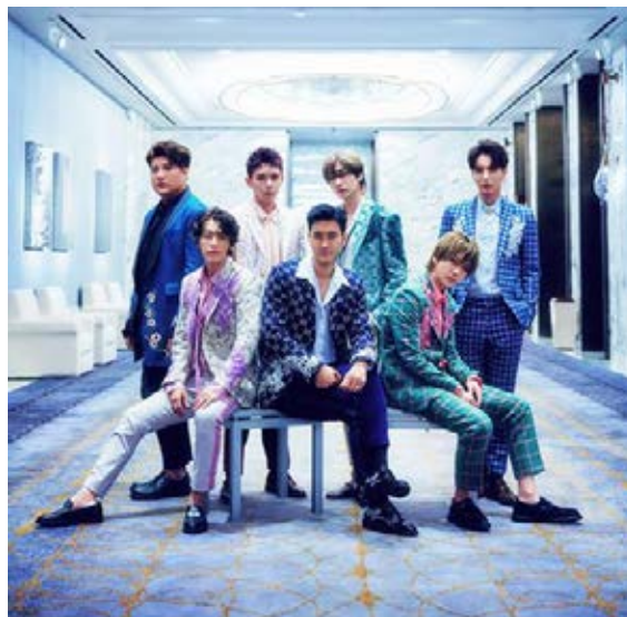
Figure 7: First Initial K-POP influencers in Thailand, Korean Popular Boy Band "Super Junior"

globalization once again has given opportunities to all countries in order to exchange information and media. Thus, some Thai broadcasting channel started bringing the foreign dramas such as Japanese, Taiwanese and Korean dramas, along with the music to Thai society. Since then, C-POP (Taiwanese / Hong Kong) and J-POP have boomed in a short time, but K-POP is quite longer and larger than the two lefts. Korean Dramas such as Dae Jang Geum, Winter Sonata, Full House, The Princess Hour, The Coffee Prince et cetera got public attention first in Thailand then followed by the singers such as Rain, TVXQ and Super Junior. Also, Korean online game Ragnarok gained a lot of unprecedented favor until now. Their media contents, music and appearances aroused Thai people's satisfaction, so that initially why the K-POP can maintain their popularity in Thailand.