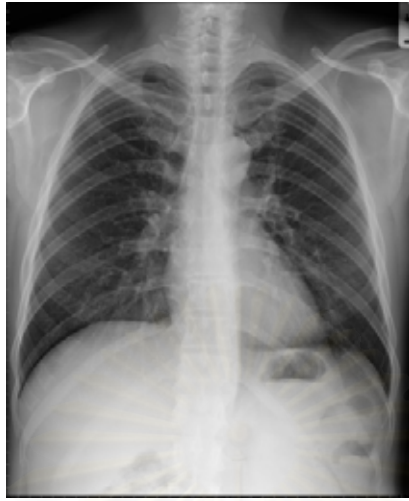
Figure 3. Within 48 hours after the therapy, a follow-up chest radiograph demonstrates a complete resolution of the infiltrates.