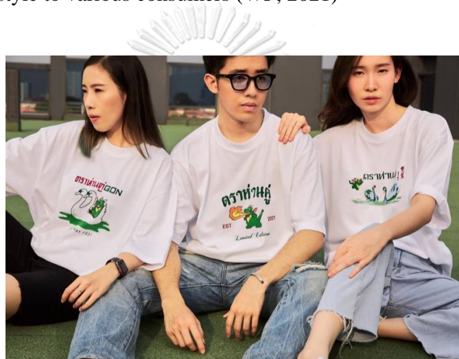
Figure 1. Gon x Double Goose Project

Even though Double Goose looks like a simple t-shirt and has no flashy marketing, the brand never stops developing. They constantly develop themselves by adjusting the designs of the shirt and rebranding the logo of the shirt to be more diverse to meet the changing lifestyle of consumers in the new era. Sometimes, the key to modernizing a brand can be in form of licensing or partnership too. Double Goose open a new experience with the launch of “Gon X Double Goose” with the belief in giving more lifestyle to various consumers (WP, 2021)