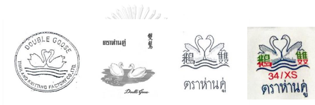
Figure 6. The first version of Double Goose logo and package

By adjusting the product logo to create a brand legend. The first design of Double Goose logo in during the time of Marshal P. Pibulsongkram as Prime Minister in 1940s. The Double Goose t-shirt logo is two geese facing each other in the water with Thai and Chinese languages (The People, 2020)