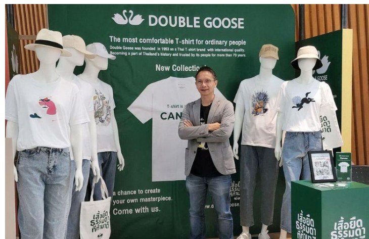
Figure 8. Double Goose Canvas New Collection

On September 13, 2022, Double Goose launches a canvas project with an illustrator its printing collection for the first time in 70 years (Tarala, 2022). This project is a further step that will communicate to their consumers everywhere. The idea is to turn a simple t-shirt into a blank canvas, giving space for Double Goose to become a special area where illustrators or designers create good works in the eyes of the consumer. Moreover, this collaboration project helps to bring the brand into the lifestyle of the current target and new generation of consumers. The first collection of T-shirts was designed by 5 famous artists and illustrators with different concepts.