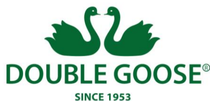
Figure 7. The current version of Double Goose logo and package

In this era, the logo appear to the public in more modern way. The geese still facing each other as before. There is a change in details, which modified the composed of the word 'since 1953' with the English word 'Double Goose' to convey that the longevity of Double Goose brand that has been around for a long time.