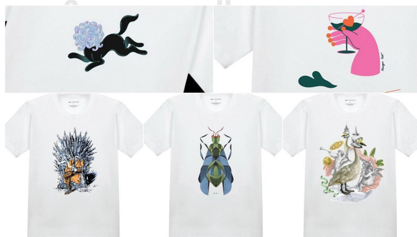
Figure 9. Double Goose Hand in Hand with 5 Artists

On September 13, 2022, Double Goose launches a canvas project with an illustrator its printing collection for the first time in 70 years (Tarala, 2022). This project is a further step that will communicate to their consumers everywhere. The idea is to turn a simple t-shirt into a blank canvas, giving space for Double Goose to become a special area where illustrators or designers create good works in the eyes of the consumer. Moreover, this collaboration project helps to bring the brand into the lifestyle of the current target and new generation of consumers. The first collection of T-shirts was designed by 5 famous artists and illustrators with different concepts.