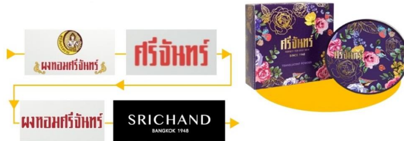
Figure 4. Full Rebrand – Change images and market position

Brand image has long been recognized as an important concept in marketing. Although marketers have not always agreed about how to measure it, one generally accepted view is the consistent with our associative network memory model, brand image is consumers' perceptions about a brand, as reflected by the brand associations held in consumer memory. (Keller, 2020)