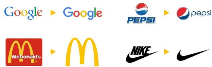
Figure 2. Brand Refresh – Minimal and Iconic Logo