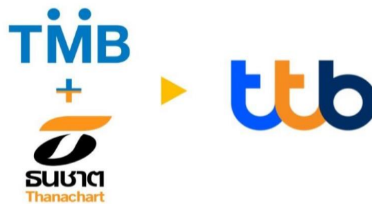
Figure 3. Brand Merger – Combination logo of two brands

For example: Thai Military Bank and Thanachart Bank form together to create another visual in simple small capital alphabet “ttb.”