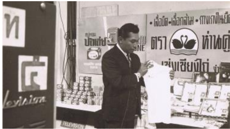
Figure 5. Thailand Knitting Factory Company Limited. The first garment factory of Double Goose

Double Goose was founded in 1953 and later established under the name of the Thailand Knitting Factory Company Limited. It was a partnership business started by several families working together. One of the partners saw an opportunity and jointly develop products and create their brand with t-shirts. Double Goose started mainly producing and selling good quality shirts for Thai people. They want to make clothes suitable for climate change and comfortable to wear. For more than 60 years, the brand known for its signature white round-neck T-shirt and tank tops, and they never stop to develop, and manage to pass on value through t-shirts to many generations.