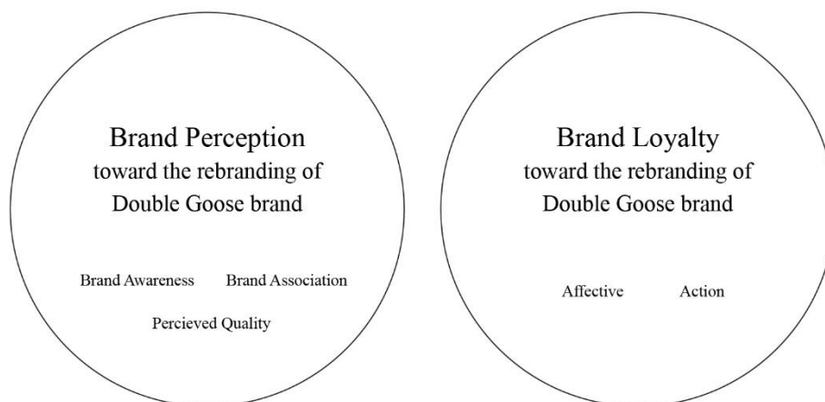
Figure 10. Conceptual Framework

The illustration shows an overview of the concept that will be used in this research. In the context of this research, we will explore on the aspect under brand perception and loyalty toward the rebranding of Double Goose brand.