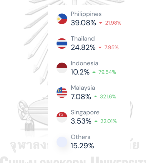
Figure 1.1.6: Country Breakdown of GENTLEWOMAN Brand Site Traffic