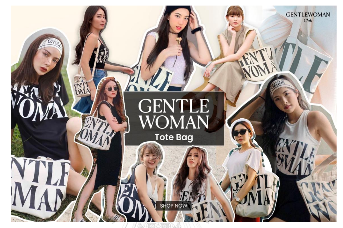
Figure 1.1.3 Figure 1.1.3: GENTLEWOMAN Tote Bag Promotional Material