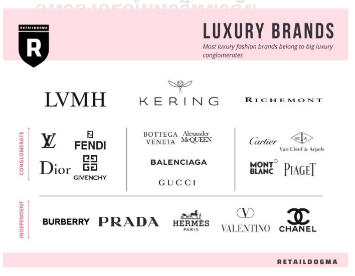
Figure 2 Top conglomerates and their well-known luxury fashion brands