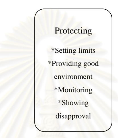
Figure 4: Protecting: Parenting adolescents strategies

As the narrative, the parents had protected their adolescent by using the four common parenting strategies (Figure 4): Setting limits, providing a good environment, monitoring, and showing disapproval.