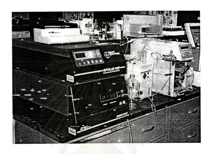
Figure 10 High performance size-exclusion chromatography (HPSEC)