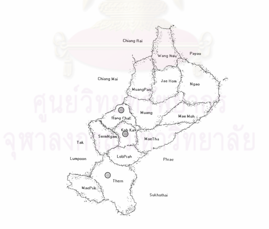
Figure 8 Collected sites of P. mirifica in Lampang province