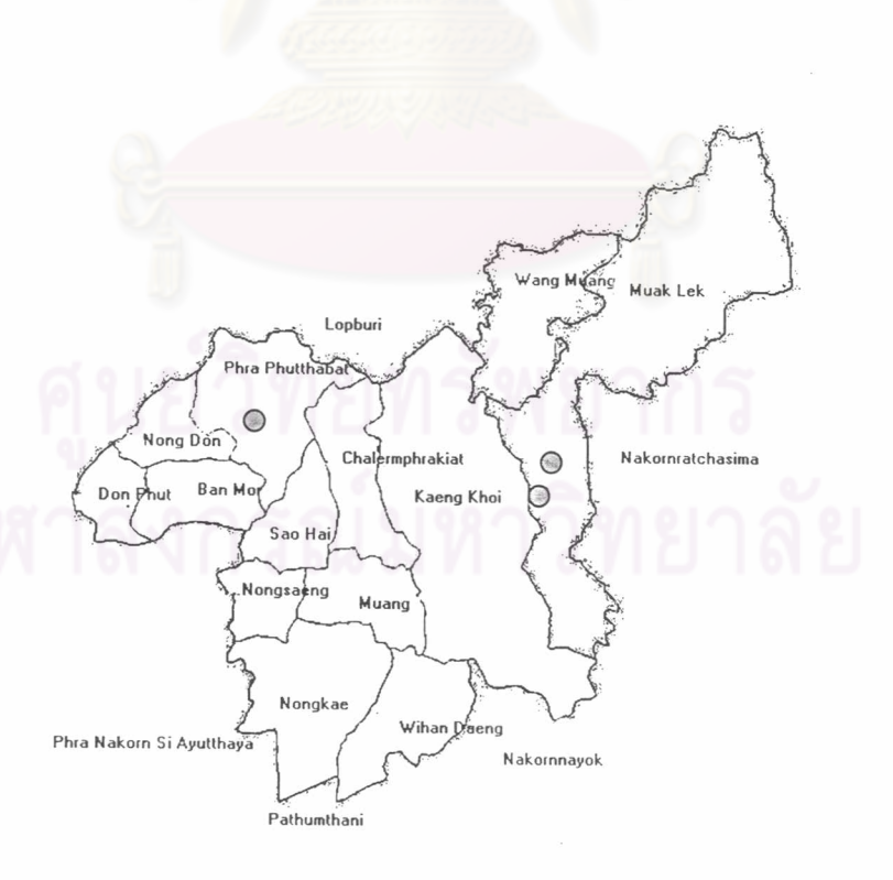
Figure 10 Collected sites of P. mirifica in Saraburi province