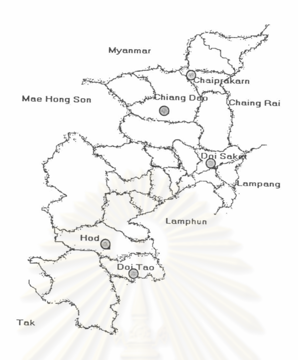
Figure 7 Collected sites of P. mirifica in Chiang Mai province