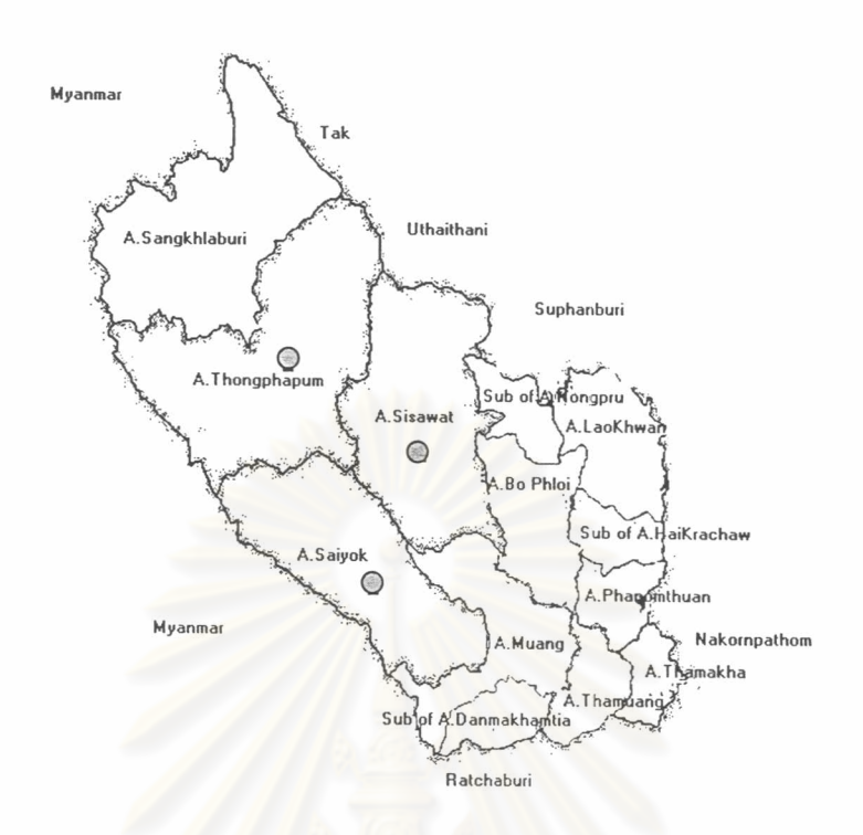
Figure 9 Collected sites of P. mirifica in Kanchanaburi province