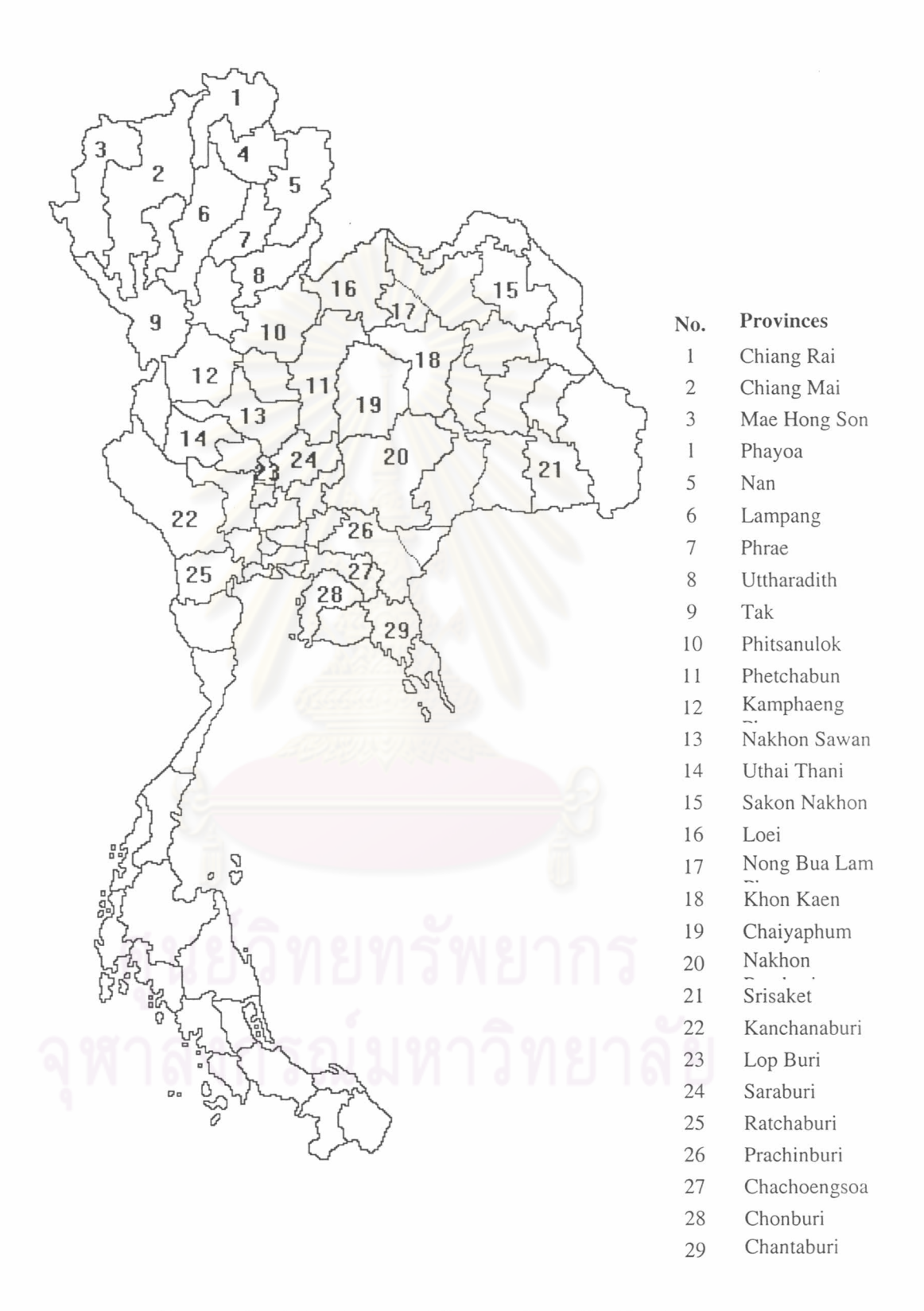
Figure 11 Distribution of B. superba in Thailand (Cherdshewasart unpublished data)