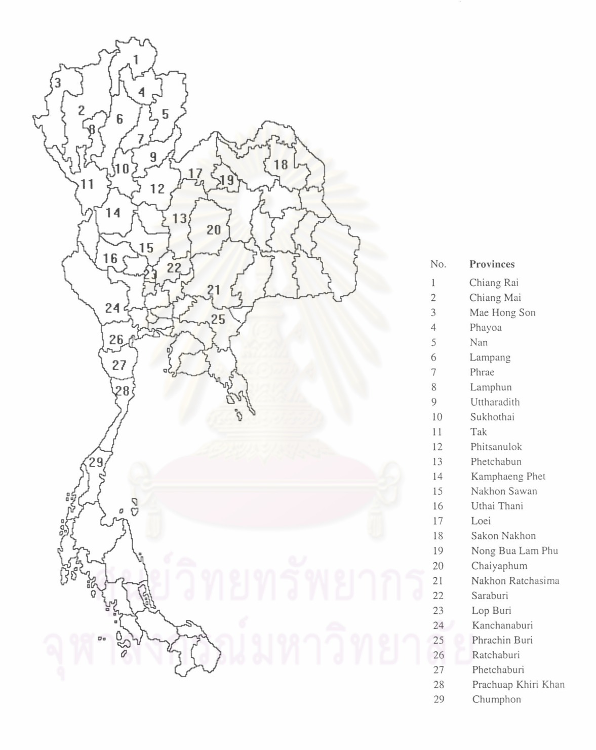
Figure 6 Distribution of P. mirifica in Thailand (Cherdshewasart unpublished data)