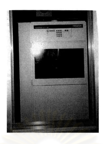
Figure 3.3 The Xenotest Beta Lamp chamber for accelerated UV

The Xenotest operation program was based on standard method ISO 4892 under the following parameters as shown in Table 3.3