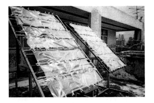
Figure 3.2 The exposure racks for outdoor exposure study

Exposure condition for the testing method of photodegradation was based on the report of Thailand weathering climate at Bangkok Metropolis. The weathering climate data were received from the Meteorological Department. The collected data, including average of temperature, %relative humidity (%RH), total radiation and rainfall amount, are shown in Table 3.2.