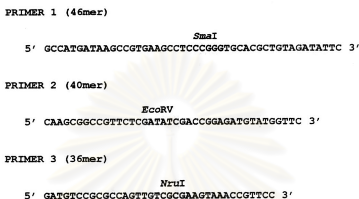
Figure 17. Oligonucleotides used in the USE procedure. The restriction recognition sites are shaded.

three primers are shown in Figure 17. For the screening of the mutants, primers 1, 2 and 3 were also designed to create Sma I, Eco RV and Nru I sites at the mutation sites, respectively.