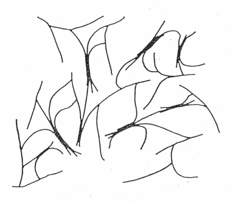
Figure 2.4 Structure of molecules in a cooked starch paste

Rodehded, C., and B.Ranby(13) studied the grafting of acrylonitrile with granular and gelatinized starch. It was found that the efficiency of the grafting was higher with gelatinized starch rather than with granular one. The accessibility of starch for grafting is enhanced, which will increase conversion. The resulting starch-g-PAN from gelatinized starch gave about eight times higher molecular weight than that from granular starch. A higher molecular weight of the graft copolymer has shown to give higher water absorption (14).