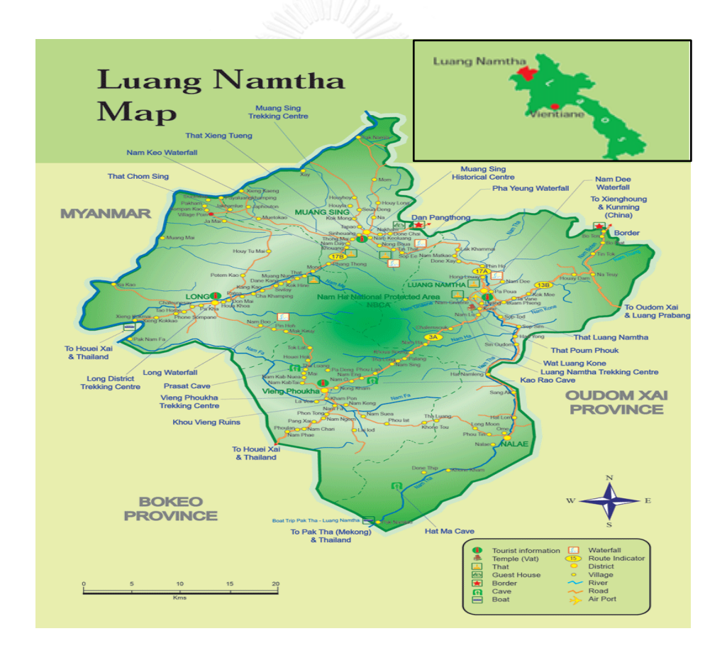
Figure 3. Map of Luang Namtha Province, Lao PDR

The map below shows the location of Luang Namtha province (GMS Sustainable Tourism Development Project in Lao PDR, 2014).