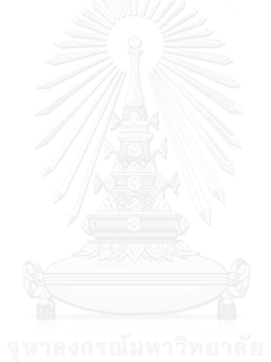
จุฬาลงกรณ์มหาวิทยาลัย Chui ai nuckorn University