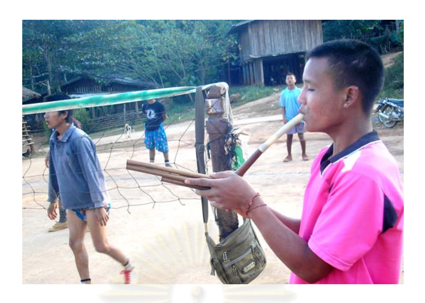
A schoolboy playing Khaen to support his friends playing valley ball

Only a few male students nowadays can play some of those musical instruments well. Very few students can sing Muser folk songs. They feel it difficult to understand the lyrics and to learn them by heart is even more impossible. The language in folksong lyrics is not similar to daily Muser spoken language. They do not have much interest in Muser folksongs because of language barrier. In addition, students do not like the slow and monotonous melody of Muser folk songs. In contrast, they very much love Thai and international pop or hip-hop songs. They have the chance to learn songs from Thai teachers in class. They can also watch TV or listen to radio and learn those songs by heart.