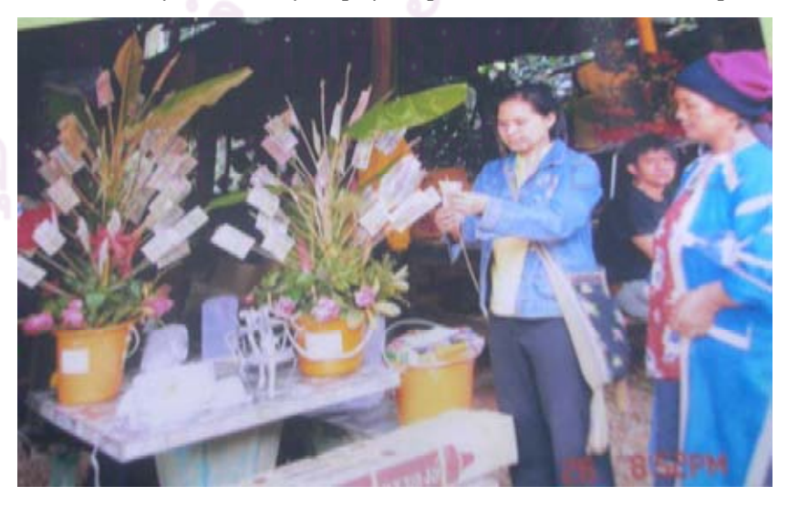
A merit making tree (thambun) ceremony in Huaiplalod school