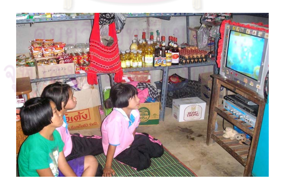
Muser students watching TV after class

Only a few male students nowadays can play some of those musical instruments well. Very few students can sing Muser folk songs. They feel it difficult to understand the lyrics and to learn them by heart is even more impossible. The language in folksong lyrics is not similar to daily Muser spoken language. They do not have much interest in Muser folksongs because of language barrier. In addition, students do not like the slow and monotonous melody of Muser folk songs. In contrast, they very much love Thai and international pop or hip-hop songs. They have the chance to learn songs from Thai teachers in class. They can also watch TV or listen to radio and learn those songs by heart.