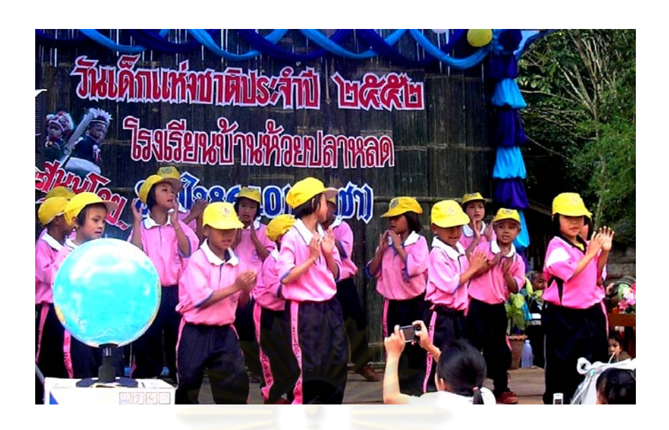
Students of Huaiplalod school dancing to a Thai pop song on the occasion of National children day

Such Thai music is well-liked by Muser students but is a nuisance to the seniors. Some seniors say it causes headache and and its sounds are not understandable. They conclude it is not good for Muser students to sing and dance like Thai people. However, as in other aspects of cultural change mentioned earlier, adults accept as it is an unavoidable process of integration into the mainstream society. What they can do is to make the change less fast and protect traditional values from being forgotten. Regarding Muser folksongs, they teach their children to sing in convenient time. They do not force children to keep away from other music and get back to enjoy Muser music. They only implant in students the passion for traditional folksongs and teach them how to sing songs and play musical instruments. They repeatedly remind their children that to throw folksongs away is to lose the identity of Muser tribe.