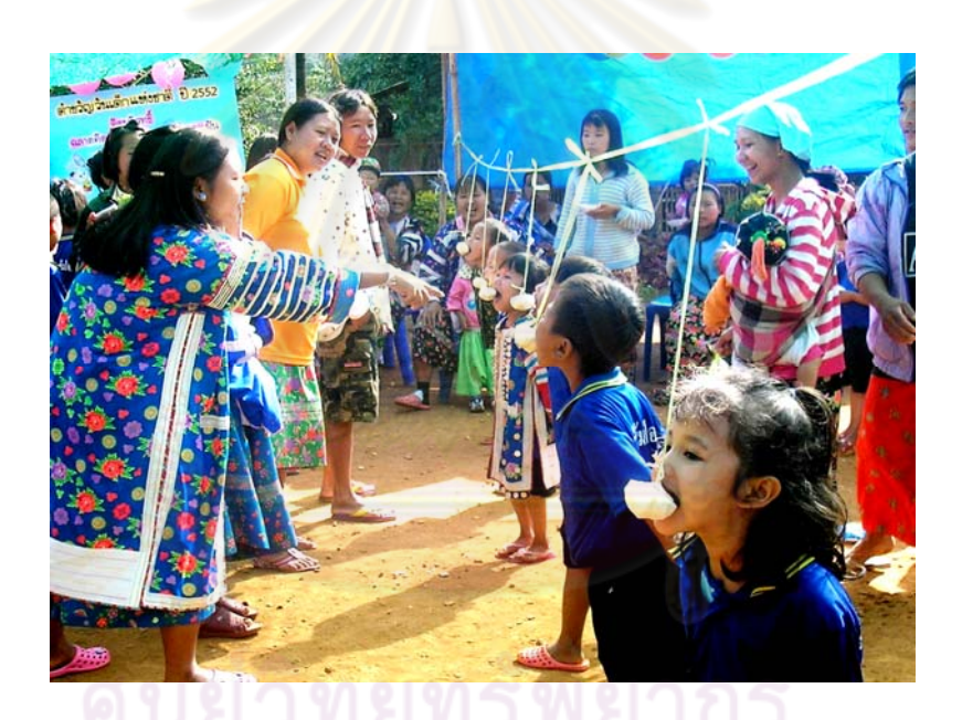
Students of Sompoi shool playing a game held by teachers on National children day

and students have much enthusiasm to play. The reason is that those new toys and games are new and exciting to them. To play traditional games, they have to make the toys themselves, which takes them time. It is so called laziness in game playing. What is more, in school libraries, there are entertainment magazines such as Reader Digest (Thai language), Dara Daily (News and gossips about Thai stars), Spicy (Star gossip), TV2 and Star News which are more attractive to them than those traditional games. Some students spend their free time reading those magazines with curiosity about their idols' stories. What lays under that laziness is the loss of characteristic game culture. When Muser youngsters can not make toys themselves and play their traditional game, a part of folklore is lost. Meaningful indications through games about nature, fertility, solidarity and animistic belief will not remain anymore. Individuals' ethnic identity will lack game culture along with the loss of many other social and spiritual values.