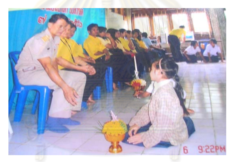
"Way khru" ceremony (ceremony to pay respect to teachers) in Huaiplalod school

library, revise curriculum and reinforce teaching staff. Outdoor extra educational activities bring chances to observe things out of their classrooms. Then students can gain experience directly. The musical performance of supposed roles brings joy to students. More than that, they know the feeling of the others in other positions and roles. Trial or pilot practice helps students deal with real things and then self study. Annually, important traditional ceremonies of Thai society are organized in the village to implant in students Thai ethical and cultural values. The conduct of those ceremonies is included in formal education plan of the school. Students have the chance to express their compliment towards their mothers and teachers. Moral behaviors are instructed and; therefore, new moral identity grows. In other words, such ceremonies play a very important role in transfer Thai culture to hill tribe students. When such cultural values are practiced more often, students have greater sense of being Thai or Thainess is reinforced.