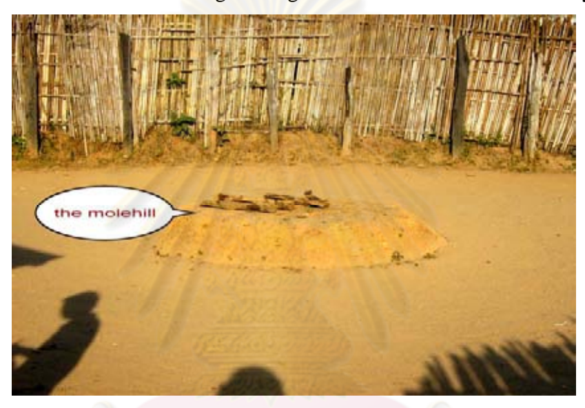
Here they hold the semi-monthly rites in honor of G'ui-sha (in Muser spoken language), the supreme natural.

The most sacred place to the community is the center of the village, the fenced dancing circle where most festivals and ceremonies take place. There are serious taboos for all the villagers in this place. For example, they are banned to set their animals on lease to hang around this place because they may harm its clean environment and cause messy things that are not suitable for such a sacred place. It is seriously a violation of the rule if a woman or an animal give birth in this place and especially no sexual activities for both human and animal. In the sacred area, there is a molehill that is the place to set the fire for festivals and to put all the offerings onto. When people dance, they dance around this molehill as a center for gatherings and the focus of the community spirit.