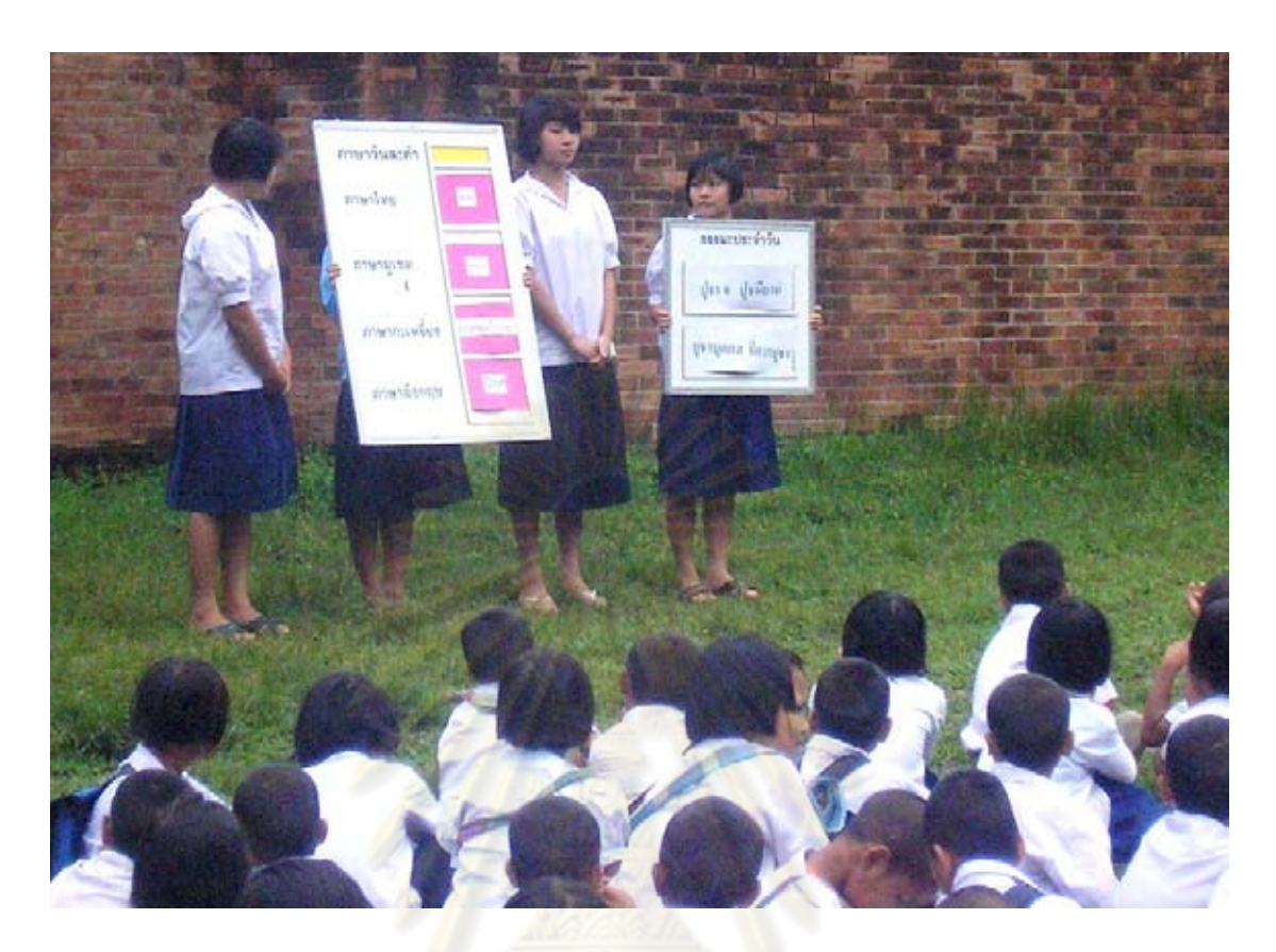
Morning "one day one word" activity after National anthem and Meditation (Thamma)