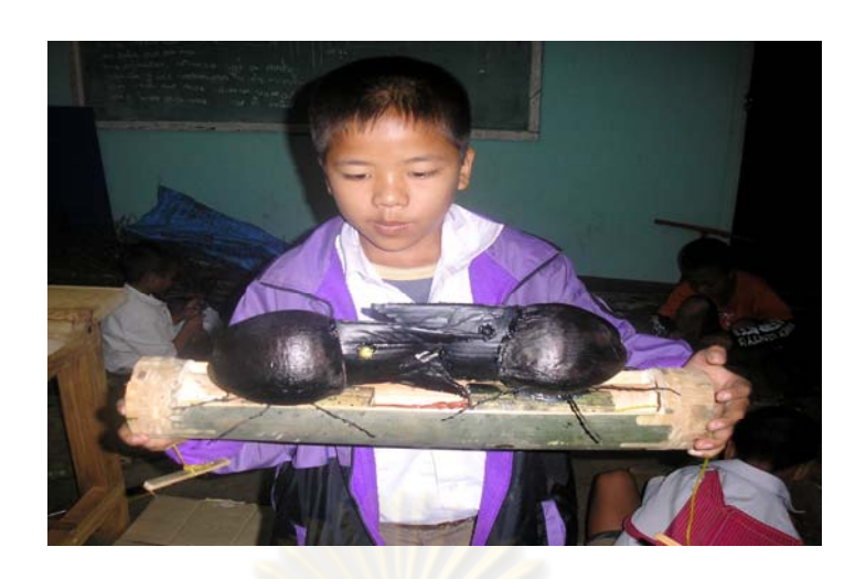
Traditional insect toy made from coconut and bamboo like this is no longer popular but can be seen only in contest organized by schools

Folklore has many cultural aspects in the relation with its elements such as narratives, music, dance and traditional games. Muser folklore helps validate Muser culture. Through folklore, Muser cultural morals and values are transmitted through generations. Muser folksongs convey Muser's way of life, beliefs and emotions. Most importantly, they bring a sense of community when they are sung in the accompaniment with Muser musical instruments. The myth in folktales being told to children contains an ancestral lineage which implants in students the pride of their history and ancestors' victories.