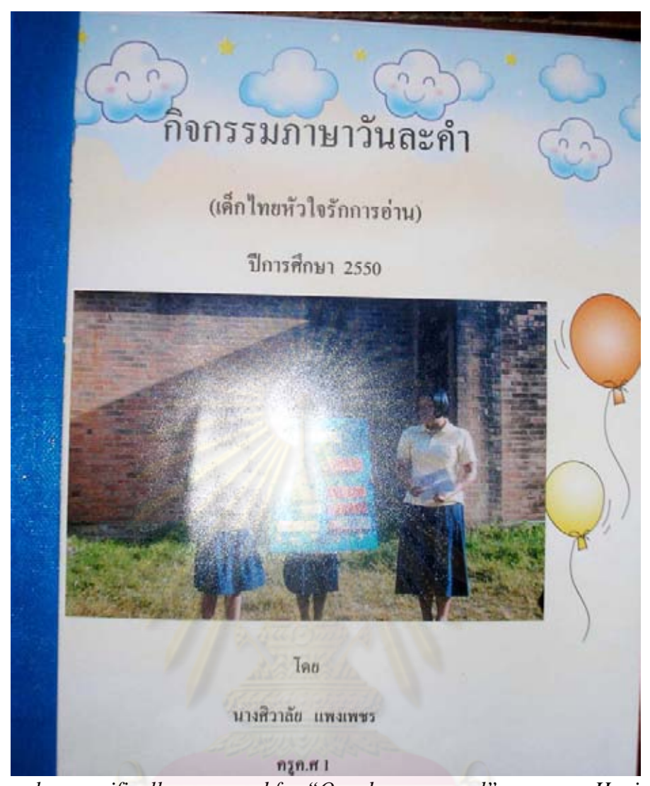
Lesson plan specifically composed for "One day one word" program, Huaiplalod school