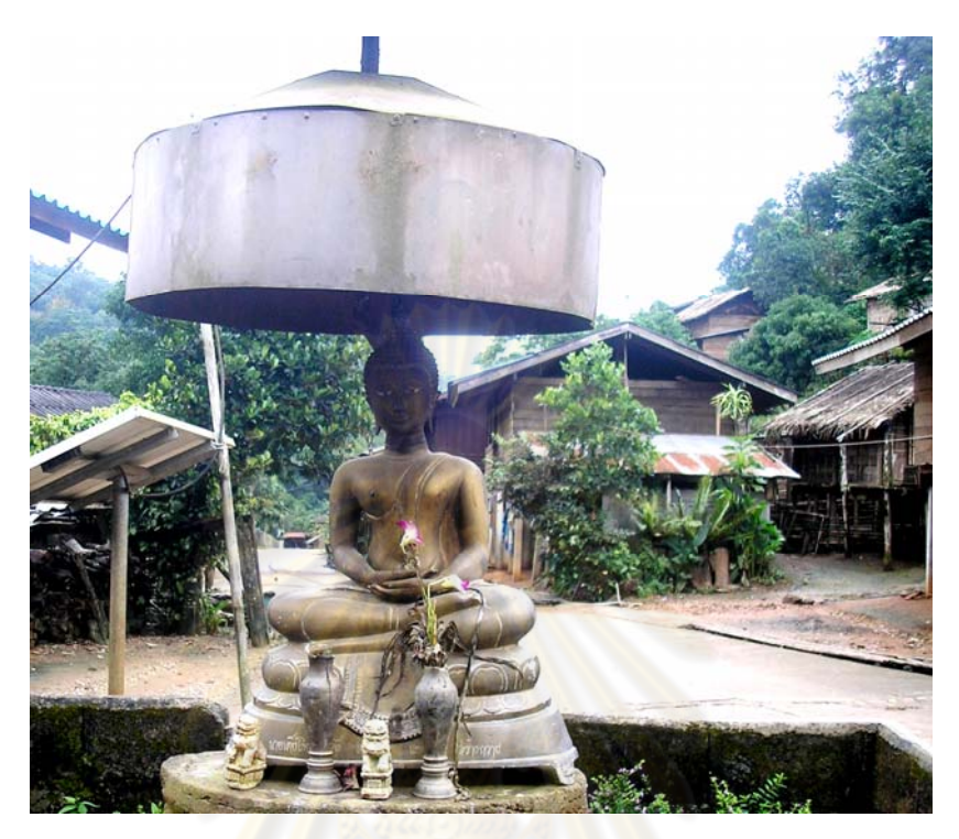
The statue of Buddha in the center of Huaiplalod village

chase bad ghosts of diseases. Since 1986, the Buddha has been located and enshrined in the village at the very revered place.