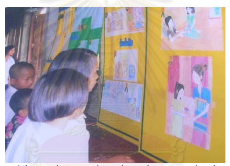
Exhibition of pictures drawn by students on Mother day

Regarding non-formal education, in the case of Muser villages in Tak, non-formal education involves most clearly in the aspects of language and culture aspects. Young learners have the chance to study English, Muser spoken language, Thai and even Karen language. Every morning, students gather in the main school yard. Two representative excellent students hold a board with vocabularies of the day on and read out loud for others students to repeat. Each vocabulary will be written and pronounced in Thai, English, Muser and Karen spoken languages. Apart from this linguistic training, Thai language is the official language of curricula and is used in classes. Thai language is part of formal education. Individual groups as mentioned in the education act in terms of non-formal education are the black Muser and the Karen studying together in one school. Besides, extra activities help improve students' awareness and