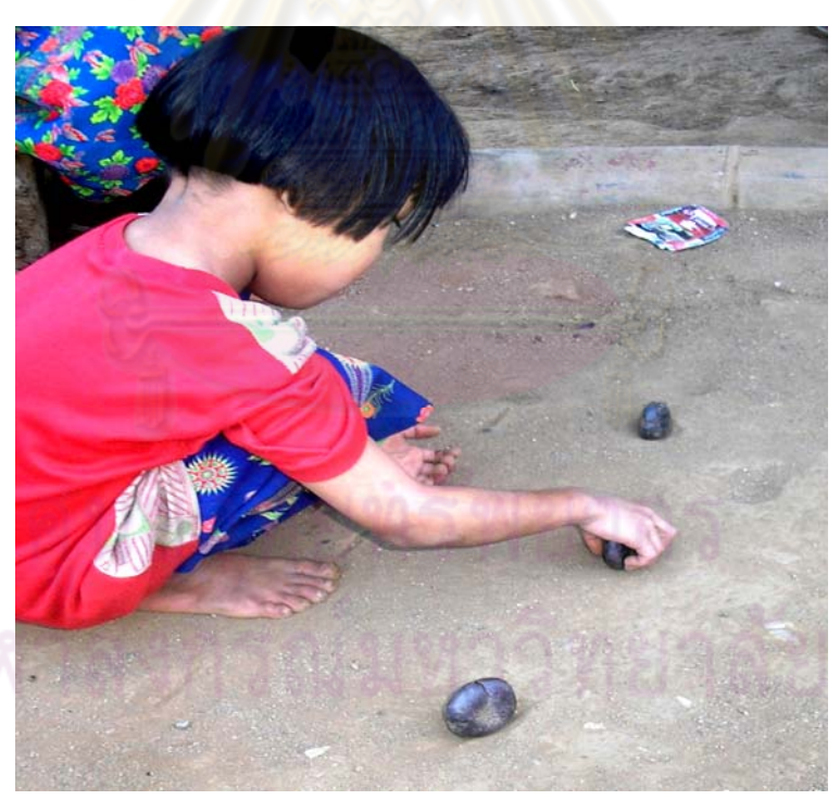
Muser girls playing Luksaba game

Nowadays students have different games to play. At schools, they are taught to play sports such as volley ball, football and so on. Plastic toys and dolls are available at small shops in the villages. On occasions of school events, new games are introduced