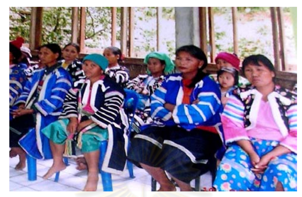
Lahu Na women (Huaiplalod village – Muser Hill – Maesod – Tak province) in traditional costume

These are held up by a belt of leather or, more rarely silver. Cloth leggings cover the lower leg. Black cotton jackets are the traditional top wear and are worn often by Lahu Sheleh and Lahu Na. The old fashion blue or black cloth turban is likewise being replaced by cheap cloth or plastic hats of European style. Men often wear heavy silver bracelets, and sometimes a row of silver rupees is attached to the shirt-front from neck to waist. As for women, they dress baggy ankle-length trousers and an ankle-length jacket which is split up to the waist. The dress fastens on the right shoulder in the style of Chinese cheongsam <sup>4</sup>(Anthony, 1986:114). Leggings are also worn by most Lahu as part of their fancy costume although they were originally used while working in the fields to keep off the parasite flies. The Lahu make beautiful bags of various design, either had woven or from quilted material, with tassels and sometimes silver limpets attached. (Gordon Young, 1974:12-13). In comparison with the description of Anthony