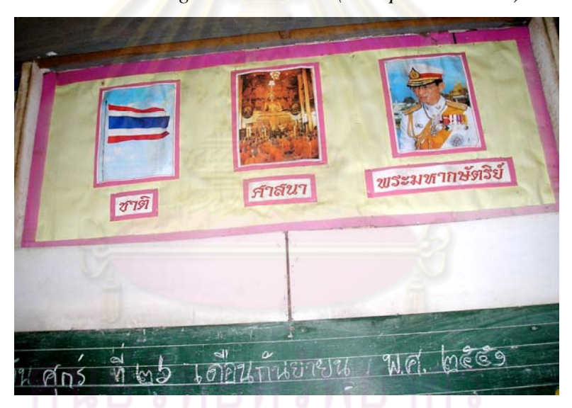
Buddha's image in classrooms (Sompoi school)