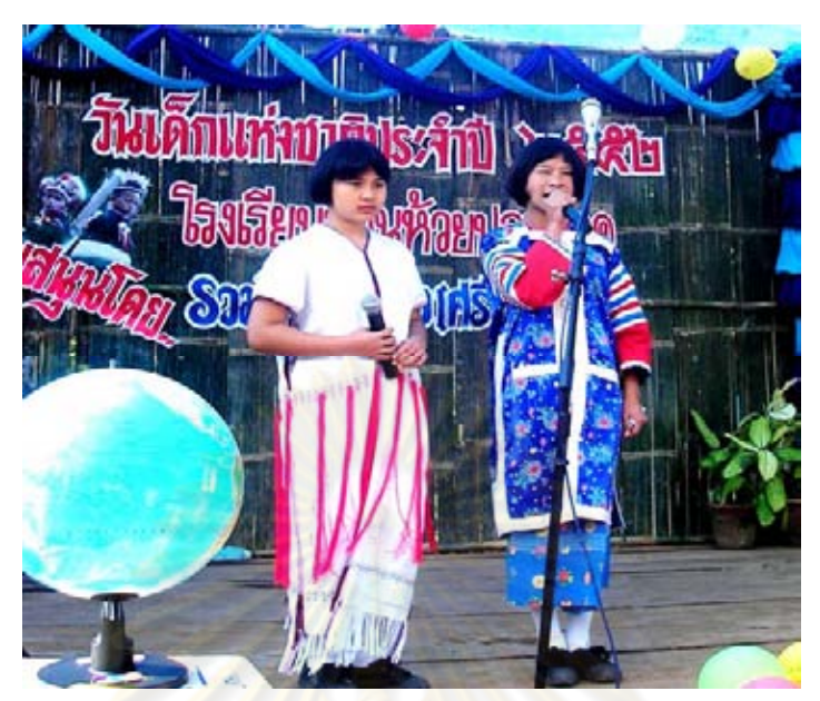
A Muser student and a Karen student being MC for a musical performance at Huaiplalod school

messages will no longer go smoothly as before when they still used only one spoken language.