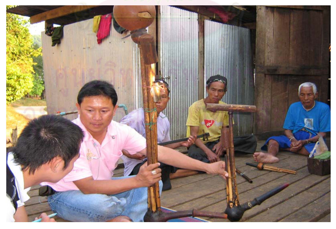
Other smaller musical instruments accompanying the mother one