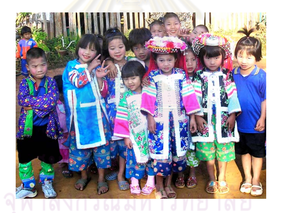
Sompoi School boys and girls in Muser traditional clothes