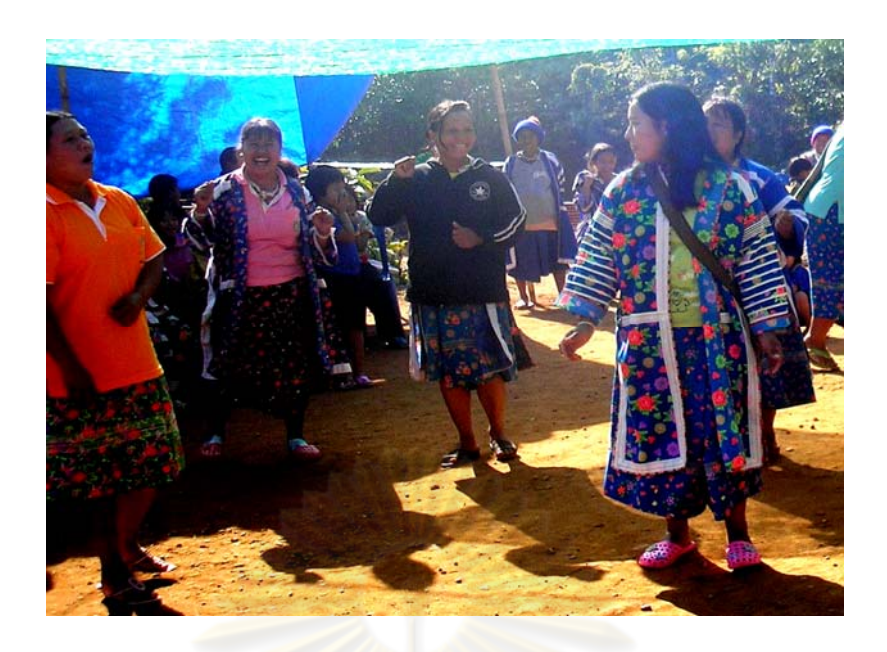
Muser mothers in Muser daily clothes (Chud Chamlong)