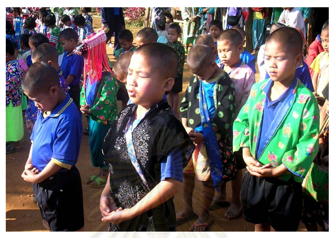
Students of Huaiplalod school mediating (Thamma) under the instruction of teachers

Expected result of the project (Ethic, Morality and Local and Thai cultural conservation Plan of Huaiplalod School, 2005:9):