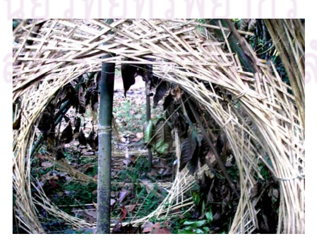
Possessed person crawls through this circle of bamboo tree to chase away the bad ghost in his/her body

When the community has bad omen or some members are sick because of the bad ghost disturbing them, they have a ceremony to chase the bad ghosts away. People believe that the bad ghost stick to the human body and make them sick. Also the bad ghosts bring bad luck to the community. Sometimes, they cause bad trade or conflict among community members and harm their property and belongings as well as their poultry. They want to chase the ghost away by crawling through a cage made from bamboo tree and leaves.