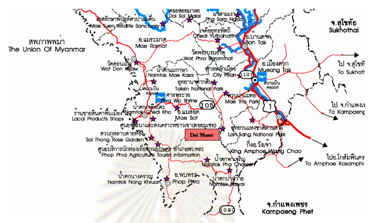
Map of Muser hill location, source: http://www.maesod.org/map.htm