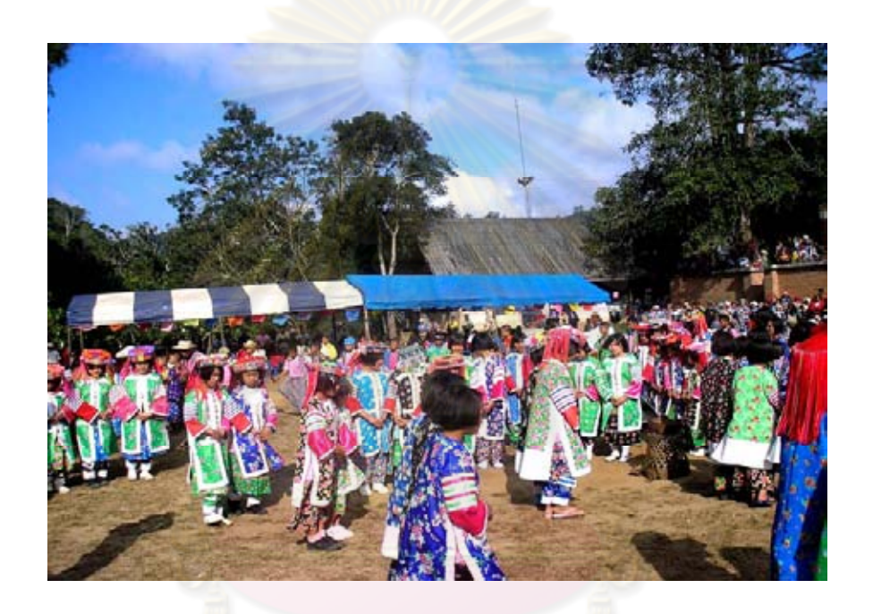
Muser students of Huaiplalod school dancing Chakhuu to welcome charity groups of corporations from Bangkok

The interest of Muser students in Muser folksongs and Chakhuu dancing is also interrupted by TV. Watching TV is always more than a series of acts of interpretation, it is, above all, a social practice as theorized by Morley (as cited in John Storey, 2003:19). According to Morley, TV watching can be a means to isolate oneself (Do not talk to me, I'm watching this). This can be interpreted in the case of Muser students that they are isolated unconsciously from Chakhuu dancing ceremonies by TV (I do not want to go dancing, I'm watching TV). The television programs soon distance young individuals from community. The chances for traditional culture transfer begin to be forgotten. Meanwhile, the risk of culture loss increases.