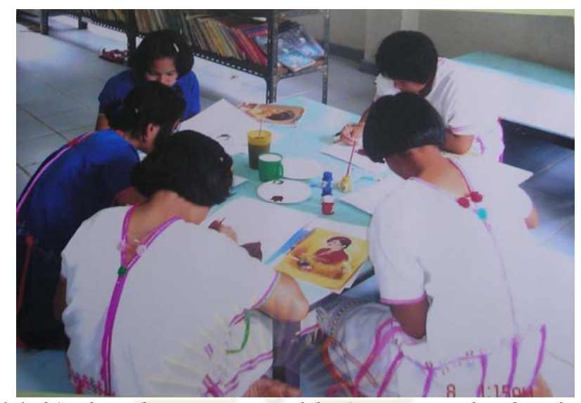
Huaiplalod Students drawing picture of the Queen on Mother day of Thailand