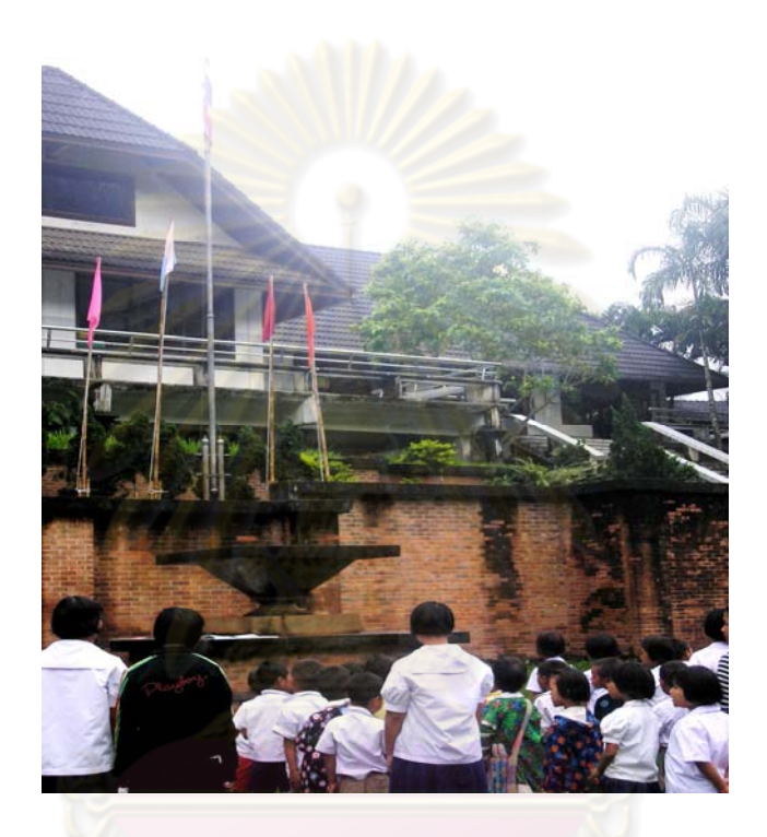
Students at Huaiplalod school singing national anthem before class time