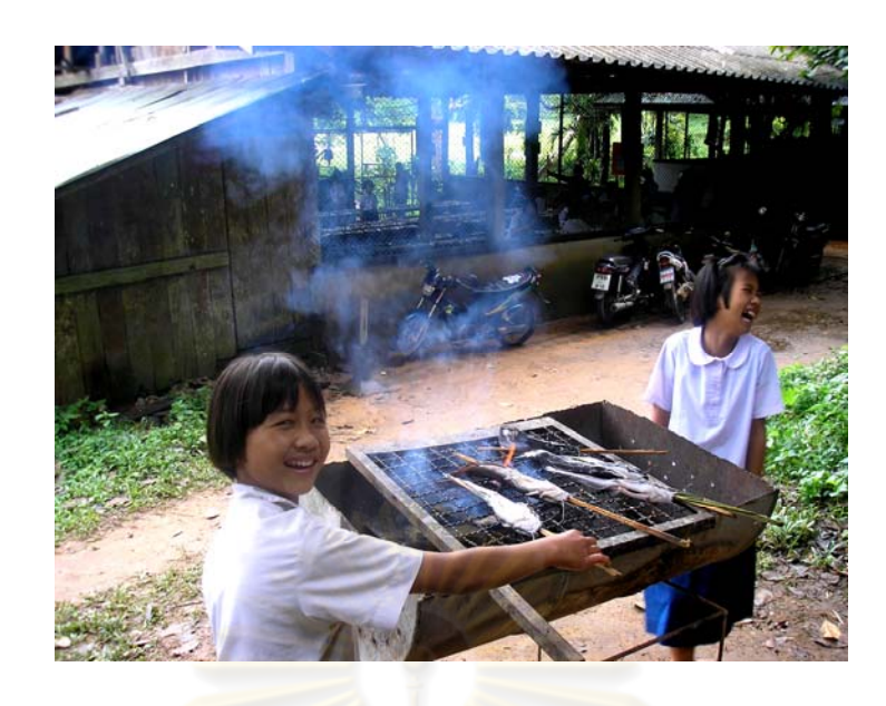
Two Muser school girls roasting fishes, behind them the canteen