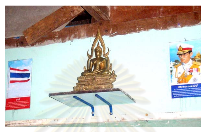
Buddha's image in classrooms (Huaiplalod school)

power. In the case of Muser hill tribe, through education, Thai state has been successful in attaching Thai identity to them with Buddhist values and inculcating a sense of belonging to Thai state or Thai government as an ultimate power.