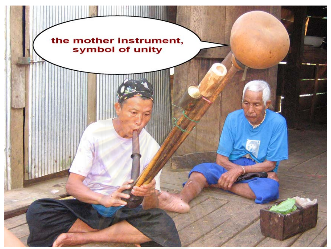
A puchan (Huaiplalod village) is playing Muser musical instrument

contact with ghosts in the important ceremonies when they are praying or worshipping. After that, when all the people join the festival to dance or to sing, other musical instruments are played out loud.