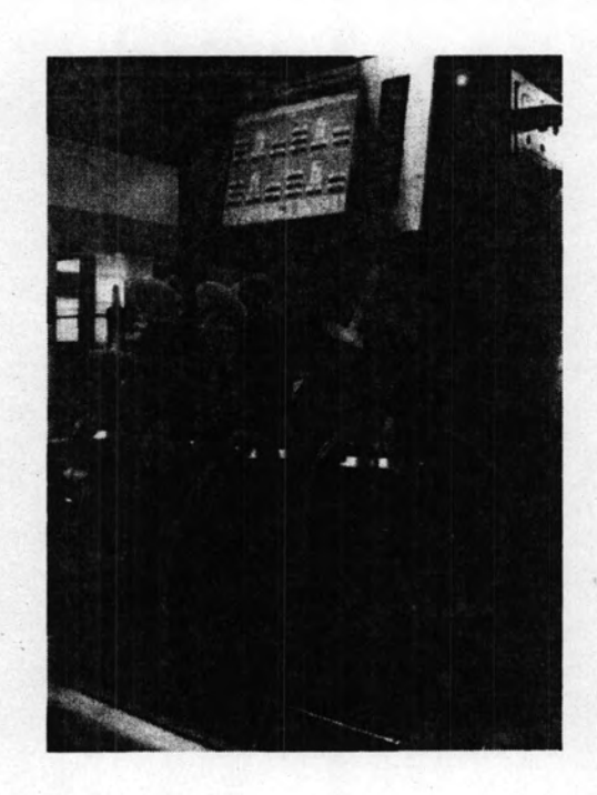
Figure 3-2 Fermentor CSTR, 4 in series