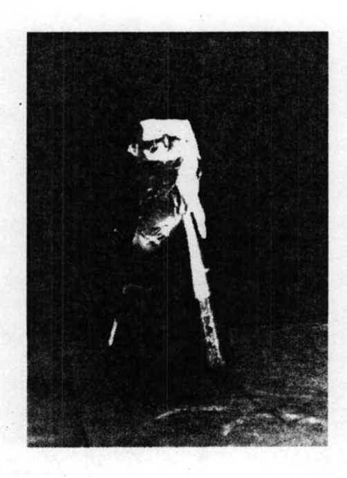
Figure 3-1 Inoculum flask of L. salivarius subsp. salivarius