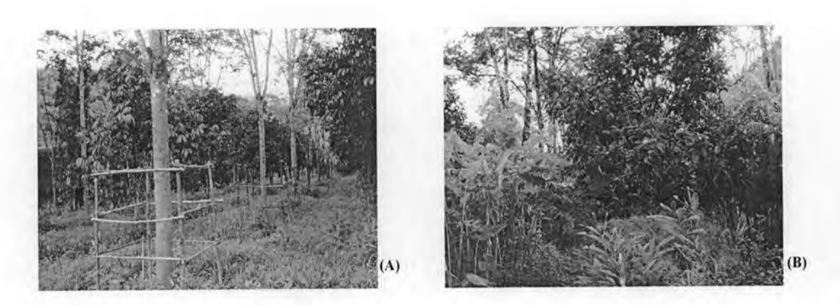
Figure 3.2 (A and B) The organic farm study site, Vimandin farm.

intercropping system design for diverse production and pest management. There are various plants such as Burmese grape, mango, mangosteen, rambutan, Parkia speciosa (sa tor), star fruit, banana, neem, pepper, and flowering plants such as Heliconia sp. Products can be harvested throughout the year. The farm was occasionally irrigated in dry season.