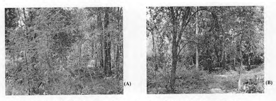
Figure 3.4 (A and B) The forest, Thongphaphum National park study site.

The forest site was located in Thongphaphum National Park, which was established in 1991 and covers a total area of approximately 700,000 rai (1,120 km²). Neighboring areas are Thungyai Naresuan Wildlife Sanctuary, Sai Yok National Park, Khao Laem National Park and Myanmar border. The selected site for this study is approximately 150 rai (0.24 km²) in size, and located in Huai Khayeng Subdistrict. The site is a complex limestone mountain supporting moist evergreen forest, and mixed deciduous forest. The park is the major habitat of large animals such as elephant, gaur, sambar deer, and tiger.