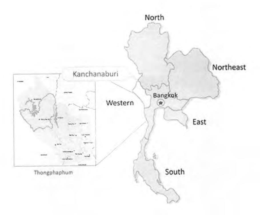
Figure 3.1 Map of Thailand showing the location of Thongphaphum District, Kanchanaburi Province. (Thailandmap.net, 2008).

The district is subdivided into 7 subdistricts, which are further subdivided into 44 villages. Thongphaphum itself is a township covers parts of the Tambon Tha Khanun. There are further 7 Tambon Administrative Organizations (TAO), i.e. Tha Khanun, Pilok, Hin Dat, Linthin, Chalae, Huai Khayeng, and Sahakon Nikhom. The district area consists of forest area mixed with agricultural lands, which includes mostly of croplands (cassava, corn, for example), and fruit orchards.