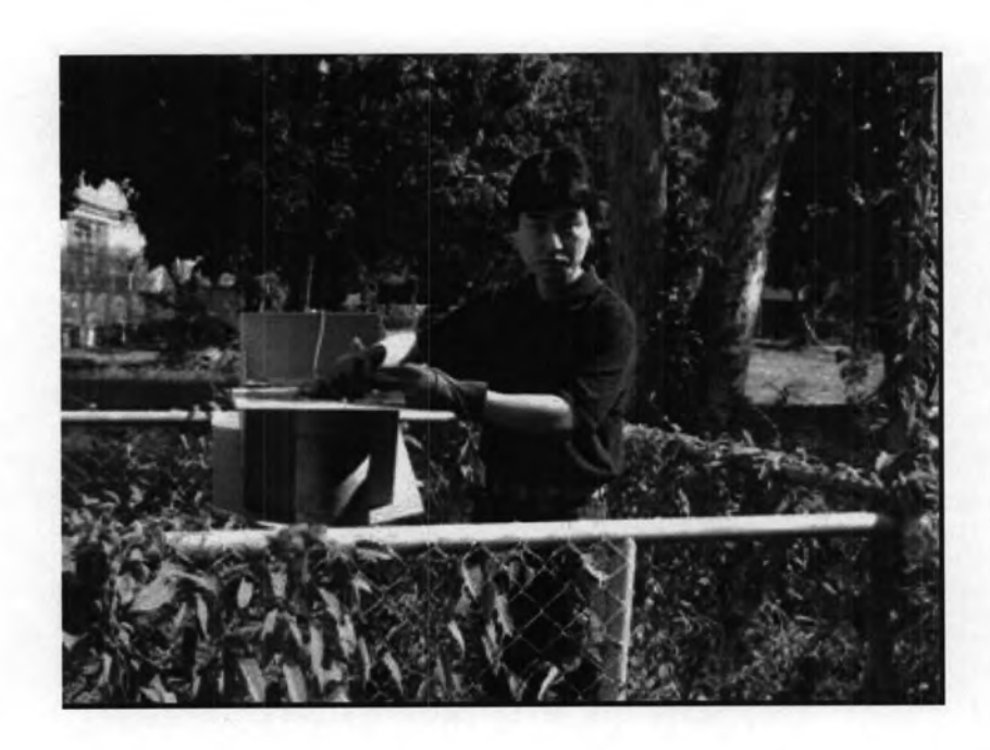
Figure 4.1 Measurement of water level.