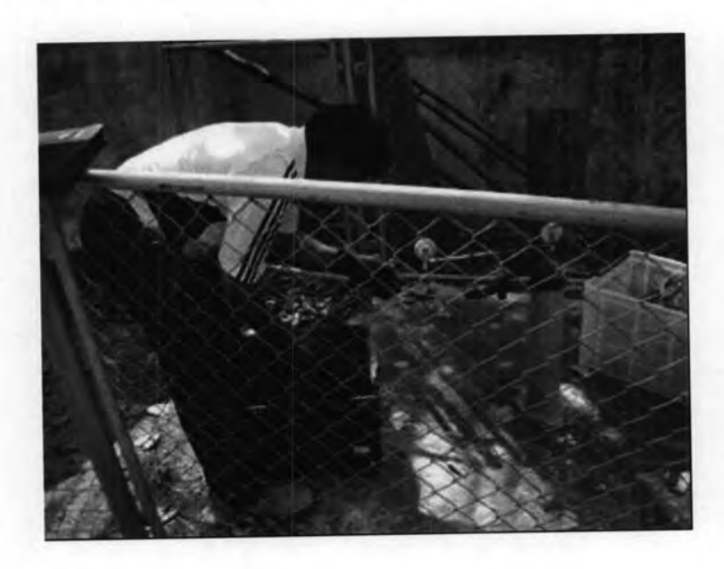
Figure.4.3 Measuring of groundwater temperature from water level to well bottom at every 2 m interval.