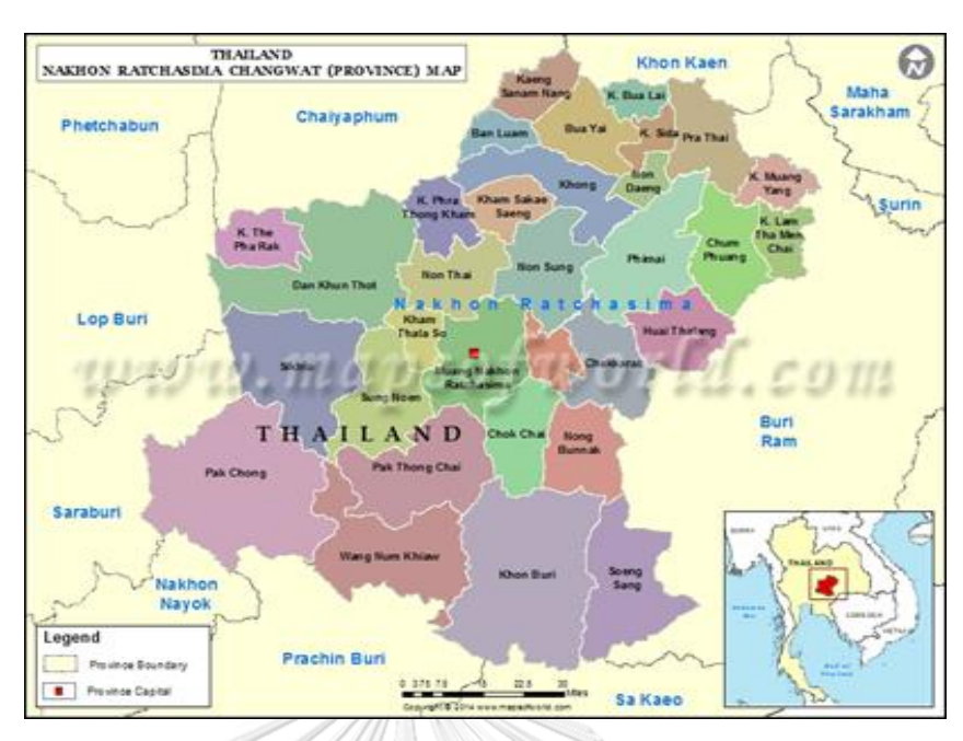
Figure 3 the area of Nakhon Ratchasima province