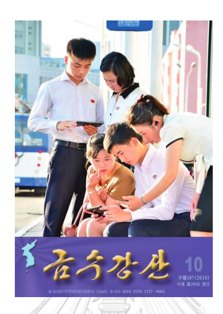
Figure 3 GeumSuGangSan 10.2018 cover page

historical heroes, the daily life of North Korean people, and criticism towards America and Japan.