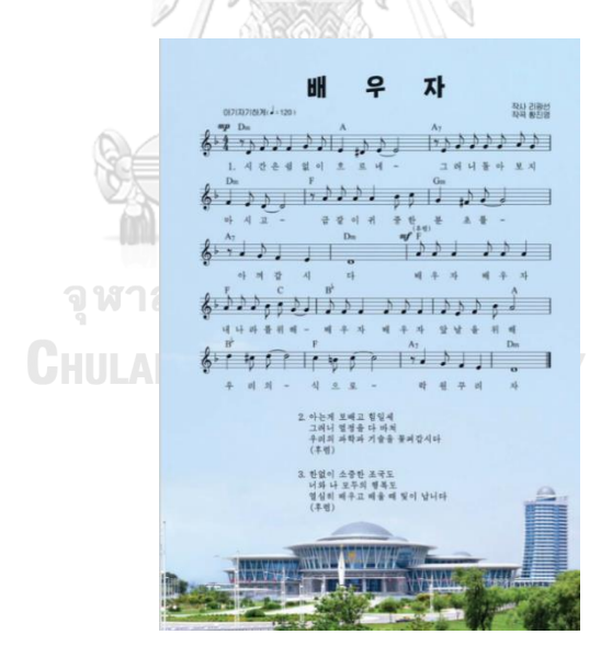
Figure 4 Inside cover page

The cover picture on the figure above shows the government will concentrate more on improving the development of technology and emphazing the importance of