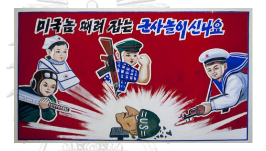
Figure 2 Anti-American Children's Poster

In contrast, the North Korean dictionary (조선말대사전) gives two definitions to the term. According to the first meaning, propaganda is something that explains an ideology, theory, or policy to the public in a logical and systematic manner. This is done so the people can recognize and understand its main idea. The second definition of propaganda is a message whose goal is to spread the word and declare war. Thus, in North Korea, the meaning of propaganda is to instruct a person to do something or give them the correct explanation for The Party's policy. The figures above show how the North Korea government created propaganda. Figure.1 shows a South Korean propaganda poster saying that the helpless and weak North Korean