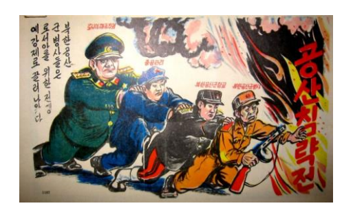
Figure 1 Anti-Communist poster