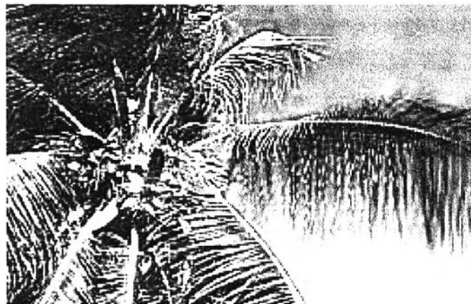
Figure 1.1 Coconut tree.