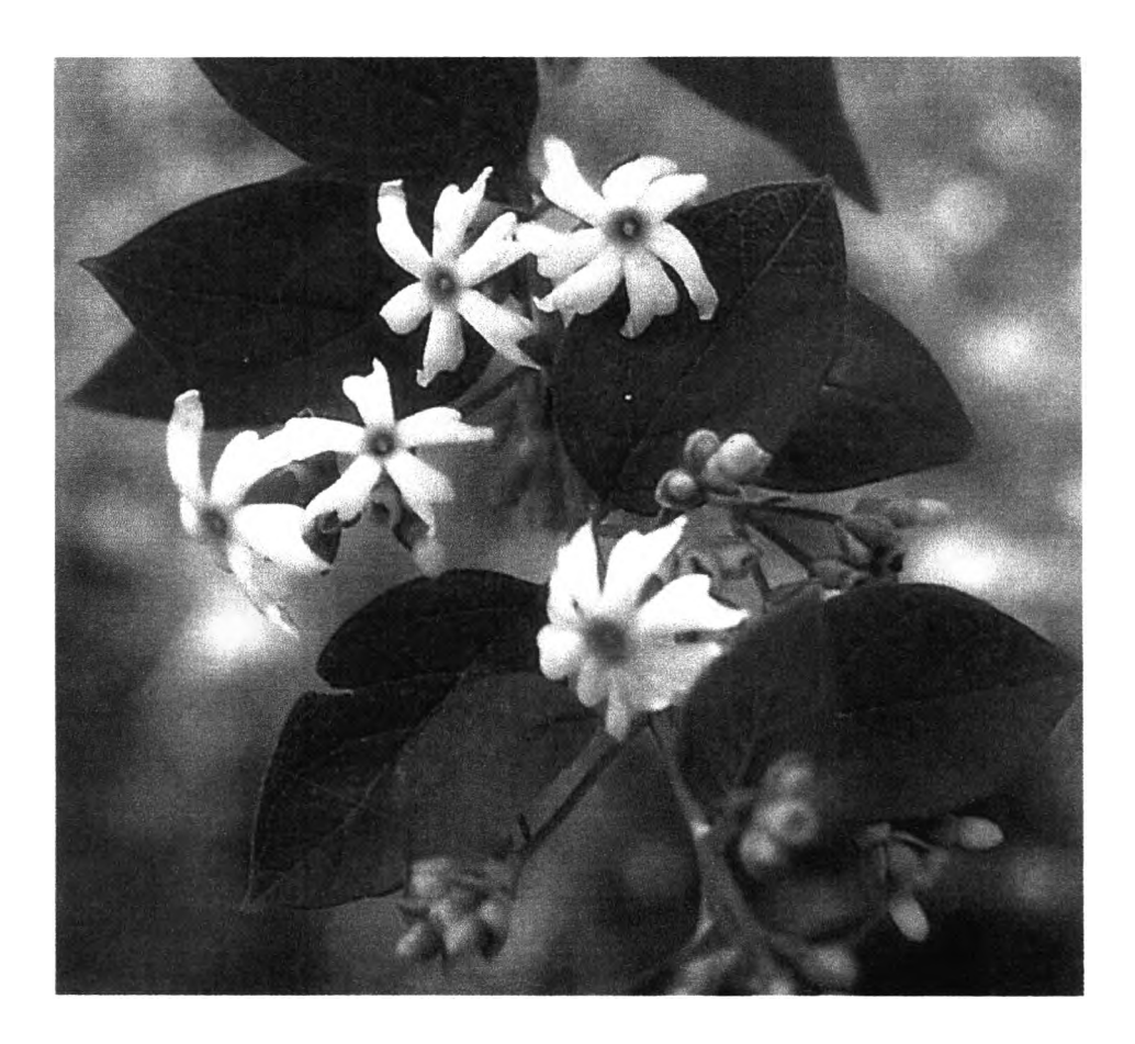
Figure 1.2 Flowers of Nyctanthes arbor-tristis L.