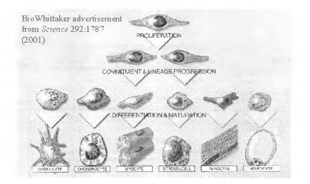
Figure3 Mesenchymal stem cell differentiation

The post-natal BM has traditionally been as an organ composed of two main system rooted in distinct lineages-the hematopoietic tissue proper and the associated supporting stroma which together with the extracellular matrix provide growth factors and cell-to-cell and cell-to-matrix interactions essential for the maintenance growth and differentiate of HSCs[67, 68]. This supportive scaffolding termed the BM microenvironment. Bone marrow stroma is a heterogeneous connective tissue which play an important role in regulating hematopoiesis. The cellular components of the marrow microenvironment include reticular endothelial cells, macrophages, adipocytes, fibroblasts, and osteogenic precursor cells which were derive from multipotent stem cell[67, 68]. Figure4 shown mesenchymal stem cell differentiation with multilineage cell types.