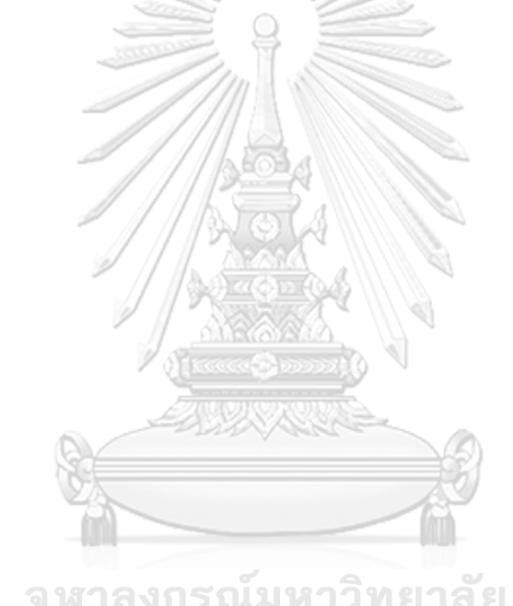
ิ จุฬาลงกรณ์มหาวิทยาลัย Chill Al ONGKORN UNIVERSITY