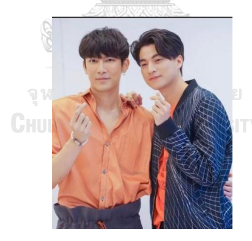
Figure 4 Tharn (Left) and Type (Right)

In the details, the love between Tharn and Type is revolved in the contrast background. Tharn is an openly gay, confident in himself and unapologetic in his expression of love. His love is intense, passionate, and direct. On the other hand, Type's initial approach to love is guarded and hesitant, stemming from a traumatic past experience that has left him with a deep-seated prejudice against gay. This dichotomy sets the stage for a profound exploration of love.