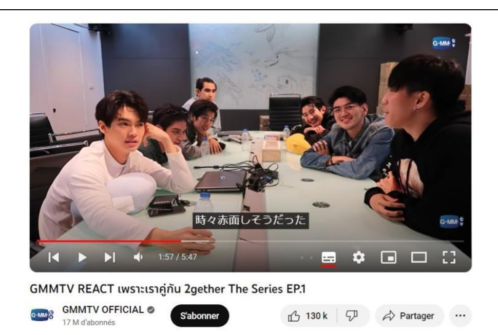
GMMTV 2gether behind the scene

For example, as in the picture above, in the GMMTV REACT feature titled "twstetstoppint 2gether The Series EP.1 Behind the scene," GMMTV's actors gather to share and discuss various behind-the-scenes stories related to the first episode of 2gether. This special segment offers fans an exclusive look into the making of the popular series, with actors delving into anecdotes, challenges, and memorable moments they experienced during the filming. It is an opportunity for viewers to see a different side of the production, understanding the effort and camaraderie that goes into creating a successful TV show.